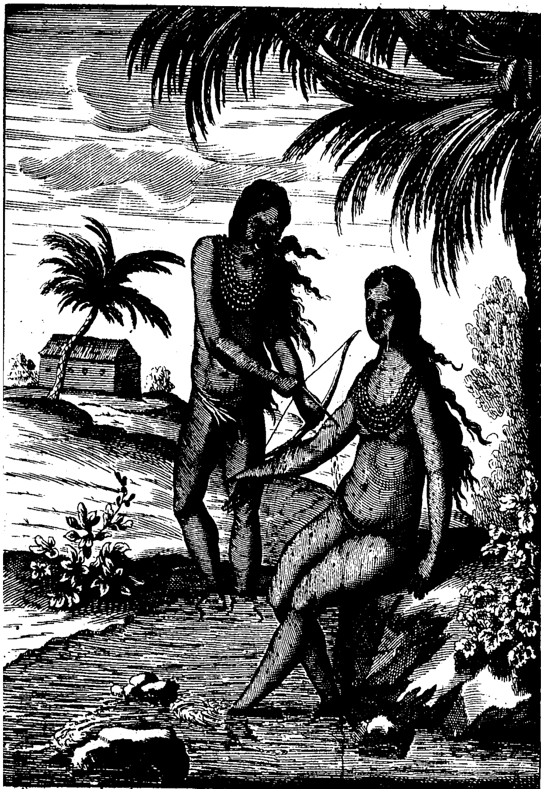
The Savage's Journal. The Indians manner of Bloodletting. Page 28