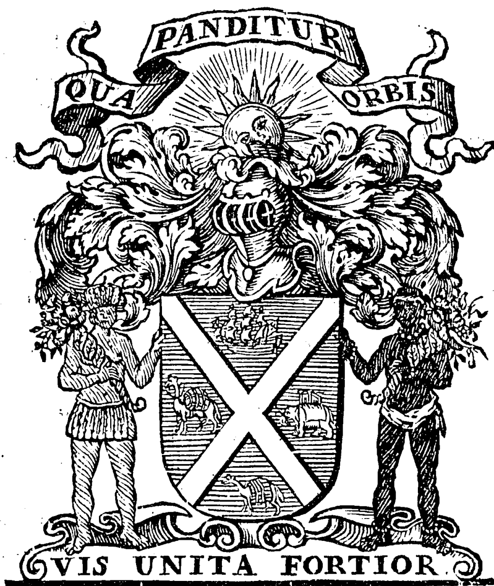
Figure 3: Coat of Arms of the Company of Scotland