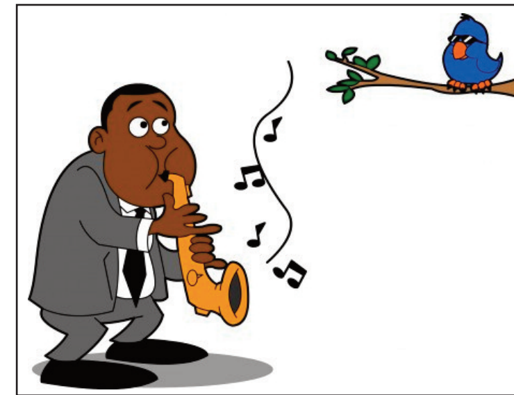
“Now's the Time” to Hang with Charlie Parker

Miles Davis has been quoted as saying, “You can tell the history of jazz in four words: Louis Armstrong, Charlie Parker.”* Bebop developed during WWII, and was a style of jazz that was faster, had more improvisation, messed a lot with harmonies and keys, and required virtuoso playing. Charlie Parker, who was also known as “Bird” was the key person in this new direction for jazz.