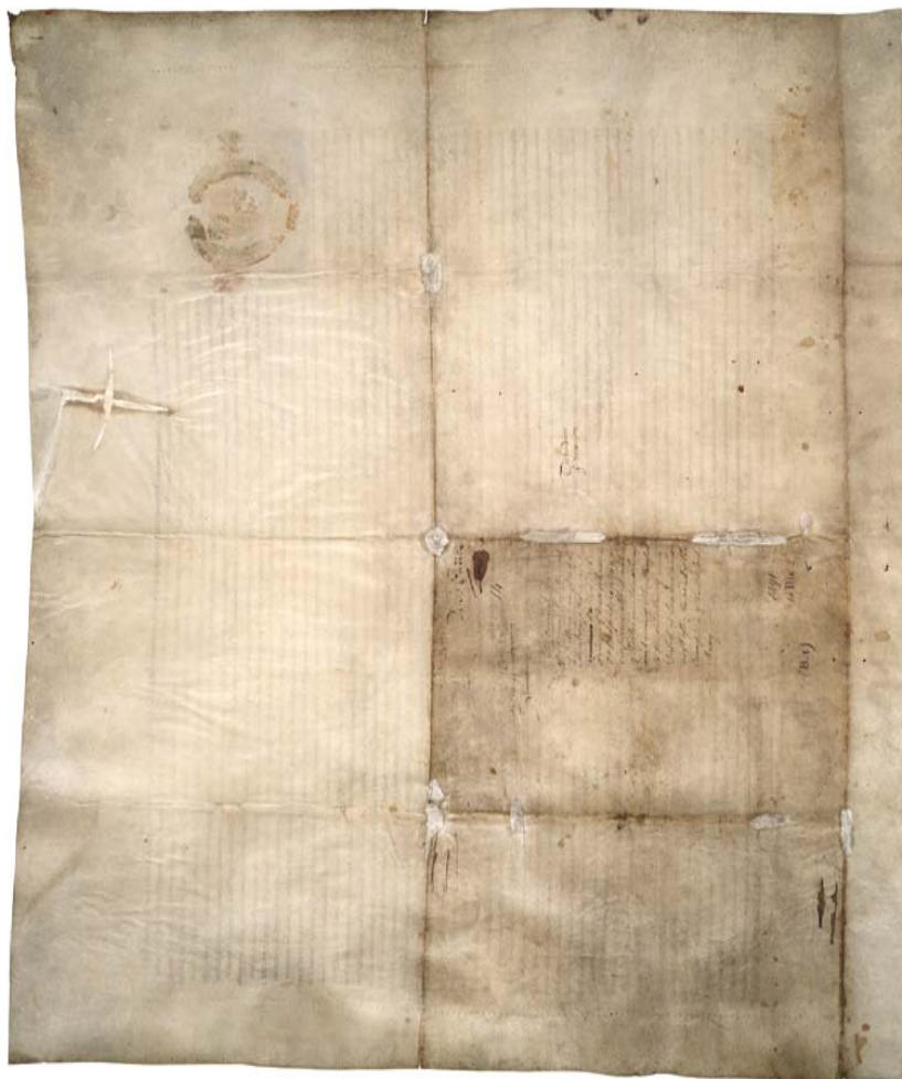
Figure 2. Dorse of Doc. Brown.4