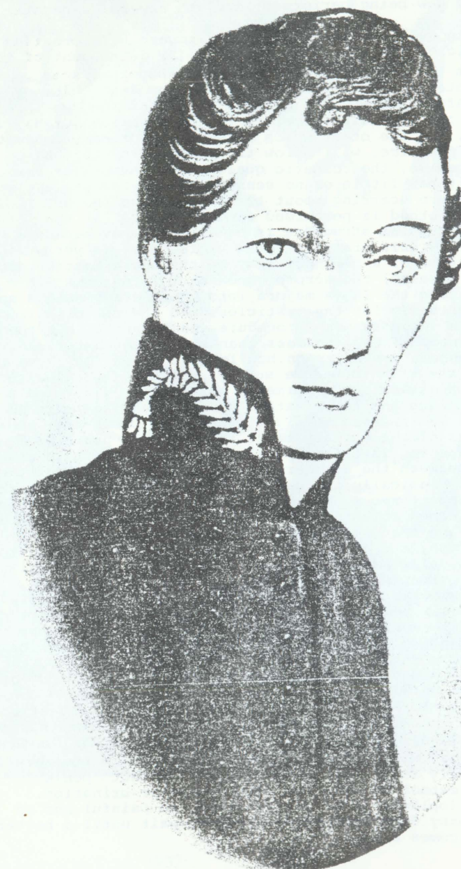
‘DR. JAMES BARRY’ Inspector-General of army hospitals. Died 1865. (From a drawing.)

Many female-to-males also undergo a hysterectomy to remove the uterus and ovaries. Some decide against this procedure, fearing loss of orgasm, as the female sexual response includes contractions of the uterus. However, most who do undergo this surgery report that they continue to experience orgasm.