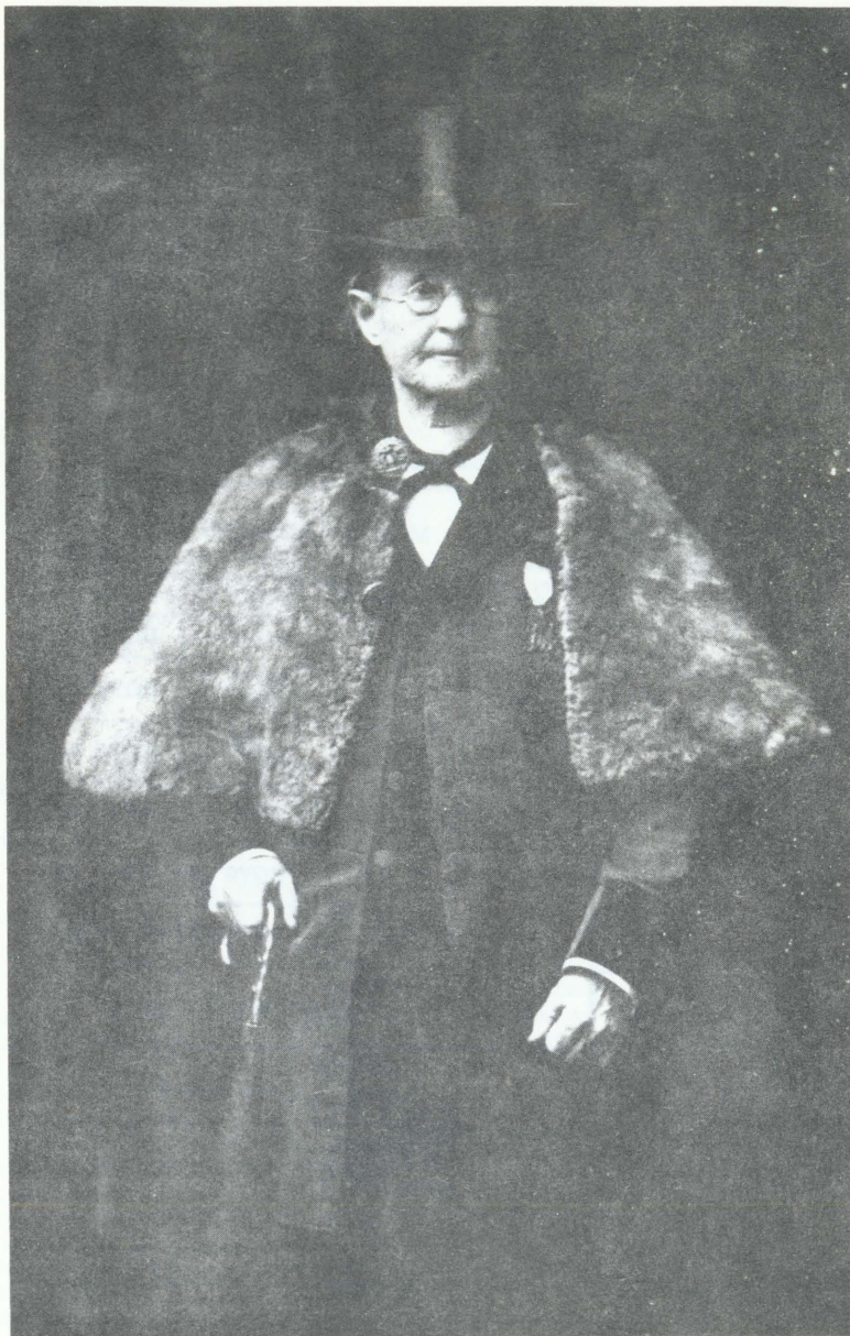
Dr. Mary Edwards Walker: