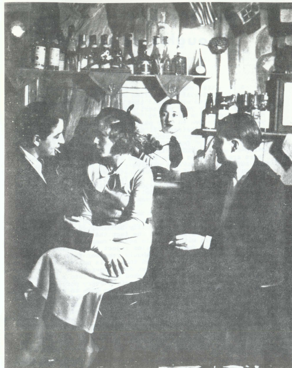
At the Monocle, Paris, 1932:

Another method consists of the removal of the "hood" of skin over the enlarged clitoris and the free-ing of the underside of the clitoris, allowing it to protrude more. Testicular implants are inserted into the labia majora, which are sutured together, leaving a small opening for urination. This method leaves the patient with little or no scarring and the result is an extremely small, but aesthetically correct "penis," which again cannot be used for intercourse or urination. Because phalloplasty is so unsuccessful, so painful and so expensive, many female-to-males elect to wait until a better alternative comes along.