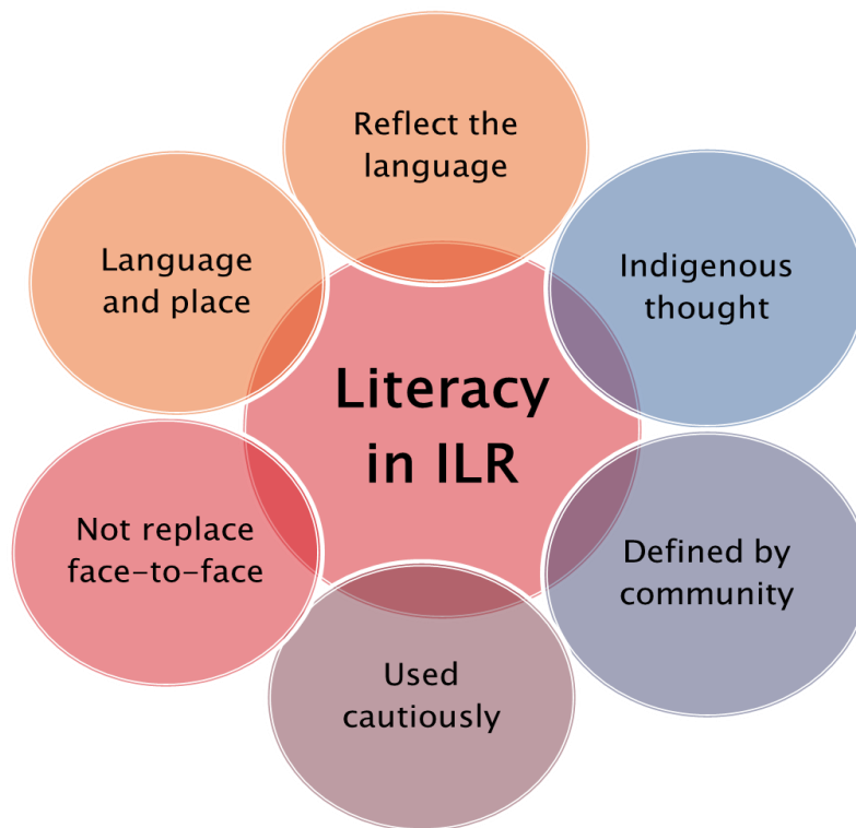
Figure 3: The role of literacy in ILR

Thus, does print literacy have a role to play in ILR? And if yes, what is its role? The answer is: conditionally, yes. The conditions that have emerged from my interpretation of the interviews and the literature, as illustrated in Figure 3, are that literacy should reflect the language itself, as well as the worldview, culture, and ways of knowing of those who speak it; it should be treated as an extension of Indigenous thought; it should be defined by the community, and its role determined by the community, not imposed from outside; it should be used cautiously and intentionally, resisting prescriptivist ideas of right and wrong linguistic forms, staying true to cultural values, and not intended to replace oral fluency or face-to-face communication; and, finally, it should reflect the relationship between language and place. The remainder of this discussion will draw on specific statements from the excerpts quoted in chapter 4 above.