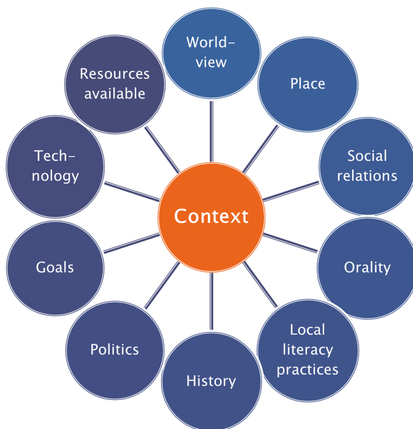
Figure 4: Forming the context of literacy in communities

Literacy as a set of social practices occurs within a broader context that varies from language to language and from community to community (Gee, 1986; Kell, 2006; Street, 2001). As Figure 4 illustrates, this context includes: worldview, connection to place, and social relations; orality and local literacy practices, including rhetorical devices, narrative and other genres, and specialized skill-based knowledge systems; the history of education, language shift, and assimilation within the community; politics within and surrounding the community; the community's goals regarding language and education; technology currently being used and technology available; and resources available for language program development, such as fluent speakers, teaching materials, funding, etc.