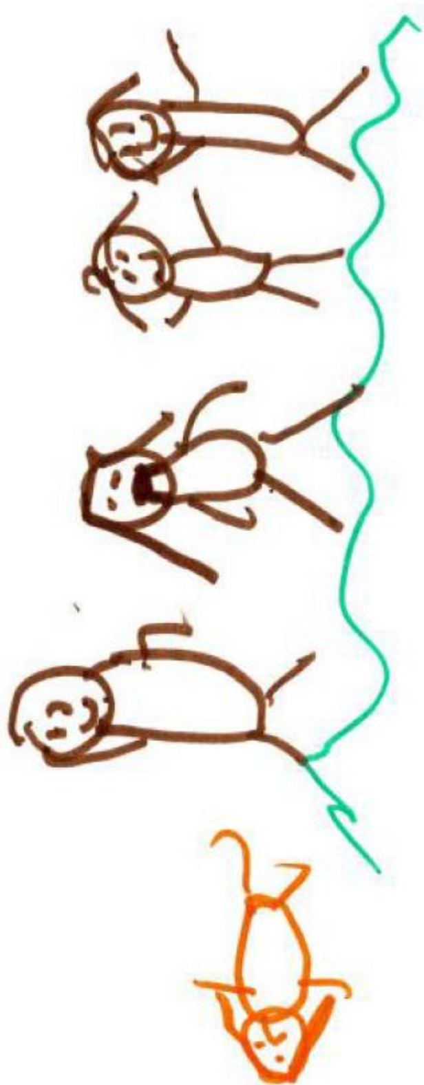
Figure 1. What it is like to have epilepsy at school. Illustration by Emily, age 8.