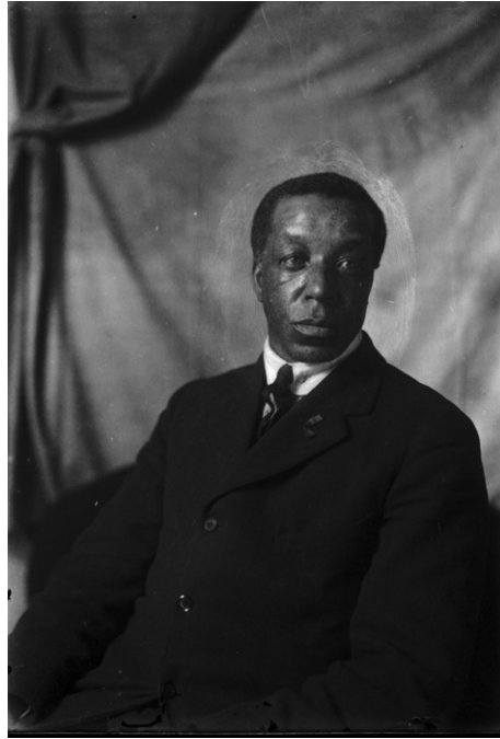
Figure 7. William Beal glass plate 42, Self-Portrait

Beal's own self-portrait, one of the very few he made, is more formally posed than many of the others. In his city suit, with a studio-like backdrop, and with his gaze focused at some distant point beyond the frame of the photograph, Beal looks a highly dignified subject.