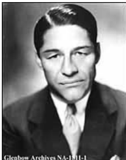
Figure 2. Portrait of Chief Buffalo Child Long Lance, ca.1930-1 2