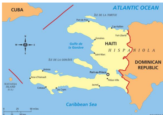
Figure 2. Map of Haiti. Reprinted from Rand McNally Education , retrieved from http://education.randmcnally.com/classroom/rmc/viewLargerMapImage.do?mapFileName=Haiti_Political_4.png&imageTitle=Haiti%20Political%20Map

Haiti is the second largest island located in the Caribbean occupying the western third of the island of Hispaniola and is part of a group of islands called the West Indies (National Geographic, 2014, para. 1). Figure 1 provides the geographical context of Haiti for the ensuing discussion. According to National Geographic, “the name ‘Haiti’ means ‘mountainous land’ and its name was given by the Arawak and Taino indigenous groups who were the first settlers to Haiti” (National Geographic, 2014, para. 1). This primarily mountainous country, about the size of Maryland is the most densely populated country in Latin America (National Geographic, 2014, para. 1). The increasingly populated capital of Haiti is called Port-au-Prince, where young Haitians migrate in search of better employment opportunities.