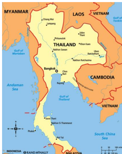
Figure 3. Map of Thailand. Reprinted from Rand McNally Education , retrieved from http://prothailand.weebly.com/map.html

Thailand is situated in the center of Southeast Asia, and is “bordered by four countries including Laos to the Northeast, Myanmar to the Northwest, Cambodia to the East and Malaysia to the South” (TAT, 2015, para 2). Thailand covers approximately 514,000 square kilometers, making it the 50 th largest country in the world (TAT, 2015, para 2). Divided into 76 provinces, with Bangkok serving as the capital city where approximately 8 million citizens live (Szczepanski, 2015, para. 1). Figure 2 provides the geographical context of Thailand for the ensuing discussion.