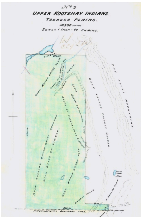
Image: Tobacco Plains Reserve plan (BC Minutes of Decision Binder 8, July 1884)

The Upper Kootenay Indians expansive land claims between the Kootenay and Columbia Rivers reduced by Peter O'Reilly to a 10,560-acre reserve.