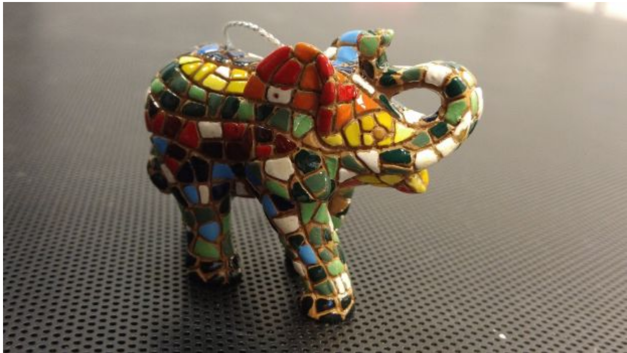
A gift to library staff at the Digitization Centre.

A UVic student recently approached our Digitization Centre to enquire about scanning fingerlings (finger drawings in cave walls) located in France. After the student was informed how much equipment was involved, she knew it would be impossible to take all the necessary hardware into the cave, but was determined to further understand the process. When the student returned to UVic a few weeks later, she asked again if she could scan another fingerling; this time it was one that she had created, hoping this approach would work instead. Pleased with the outcome, her successful conference presentation at the Smithsonian focused was on why 3D cave scanning couldn't be done. As a token of her appreciation, she dropped by the Digitization Centre to thank everyone with a gift from the Smithsonian. A lesson learned in perseverance and creative problem solving! Info on the Digitization Centre.