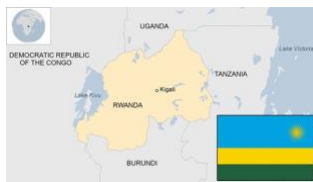
GDP per capita (current US$) - Rwanda