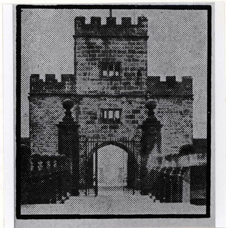
Houghton Tower.