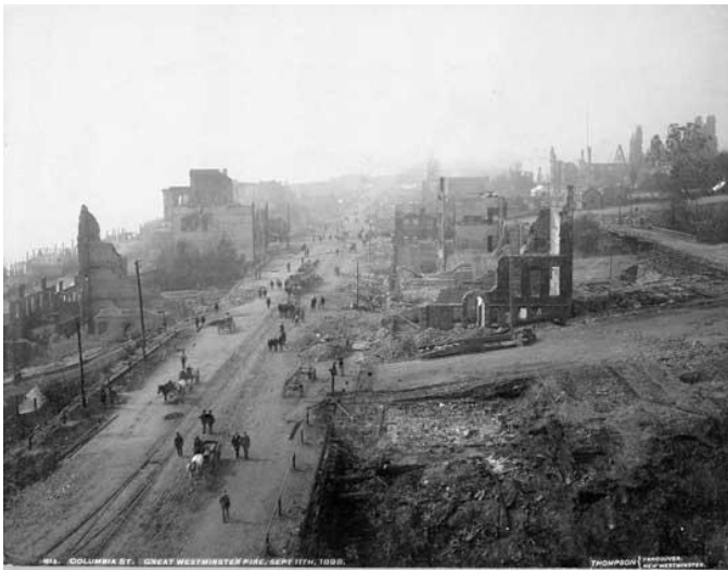
Image: New Westminster; Columbia Street After The Fire (BC Archives, A-03363, Sept 1898)

A devastating fire which destroyed the commercial core and waterfront of New Westminster, BC and displaced 500 families, no loss of life.