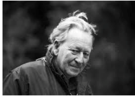
Gregory Bateson 1904-1980

Virginia worked closely with Gregory Bateson, and Drs. Don Jackson, Jay Haley and Robert Spitzer, among others while she was a psychiatric social worker at the Mental Research Institute at Palo Alto, California. Here, she had published her first book, Conjoint Family Therapy , written in 1964. The progressive professional team assisted psychiatric patients with symptoms of schizophrenia. Their patients began to heal by including their family members in treatment sessions, rather than the conventional method of isolating them from their family while in hospital. They demonstrated that pain in the family had produced a direct impact on the patient, and indeed on each individual in the "family unit" as well (Satir, 1983).