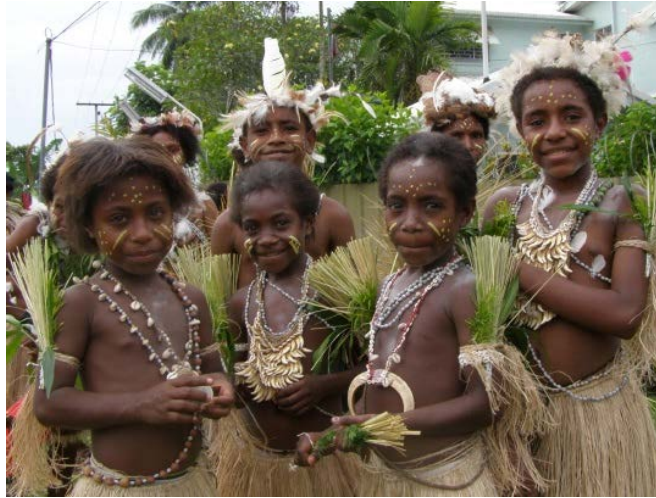
People of the Iutmal tribe of New Guinea

Our present ecological crises, Bateson contends, is being “caused by human linear consciousness and beliefs that we are somehow separate from the rest of the living world. We are destroying the living systems of earth in a false expectation of a magical future to be brought to us by technology and science” (M.C. Bateson, 1991, p. 3).