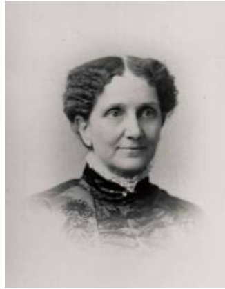
Mary Baker Eddy 1821-1910