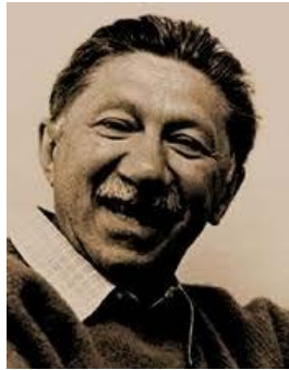
Abraham Maslow, 1908-1970

The “third wave” of modern psychology, referred to as “humanistic psychology,” is distinct from psychoanalysis, with the Freudian emphasis on the adjustment of the individual to society and the need for therapeutic transference in client sessions. Humanistic psychology is also less attracted to scientific behaviorism, in its reduction of human needs to that of surface behaviors, rather than to access the depth of the human spirit for positive change. Two main pioneers of humanistic psychology, Carl Rogers and Abraham Maslow, also shared their mutual appreciation of Virginia Satir as their contemporary (Satir, et. al., 1991).