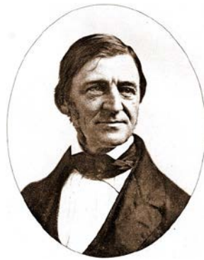
Ralph Waldo Emerson, 1803-1882

Virginia Satir had grown up in the 1910's and 1920's, in the American Midwest, in a mainly conventional, American Protestant culture. Her mother's faith, however, was developed from an American metaphysical movement known as Christian Science, whose beliefs were not too dissimilar from the nineteenth-century Transcendentalists of New England. This unique time of American thought and literature was called the "American Enlightenment" period. Ralph Waldo Emerson's development of Transcendentalism was strongly linked with the metaphysical insights of the Vedas of the Indian Upanishads. Ms. Eddy's teachings, later called Christian Science, offered similar insights but she framed them within a biblical, New Testament context.