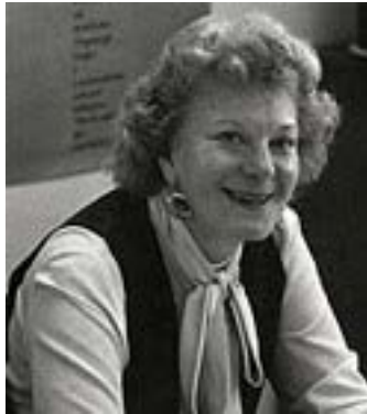
Virginia Satir 1916-1988

Virginia Satir and her clinical colleagues at the Mental Research Institute at Palo Alto discovered among the many issues of the “identified patient,” and common to each, was the feeling of low self-worth. In addition, the patients had usually taken upon themselves the conflicts that their parent had as a couple. Virginia Satir, as the clinical social worker, worked to actively reduce the conflict among the other family members, and discovered there were then changes to the psychological health of the identified patient. This was groundbreaking, but was not accepted by the medical community at that time, as medical research was mainly restricted to sensory and cognitive testing, and did not include a connection with the affective (emotional) dimension, and insisted on isolating the patient from the family for treatment.