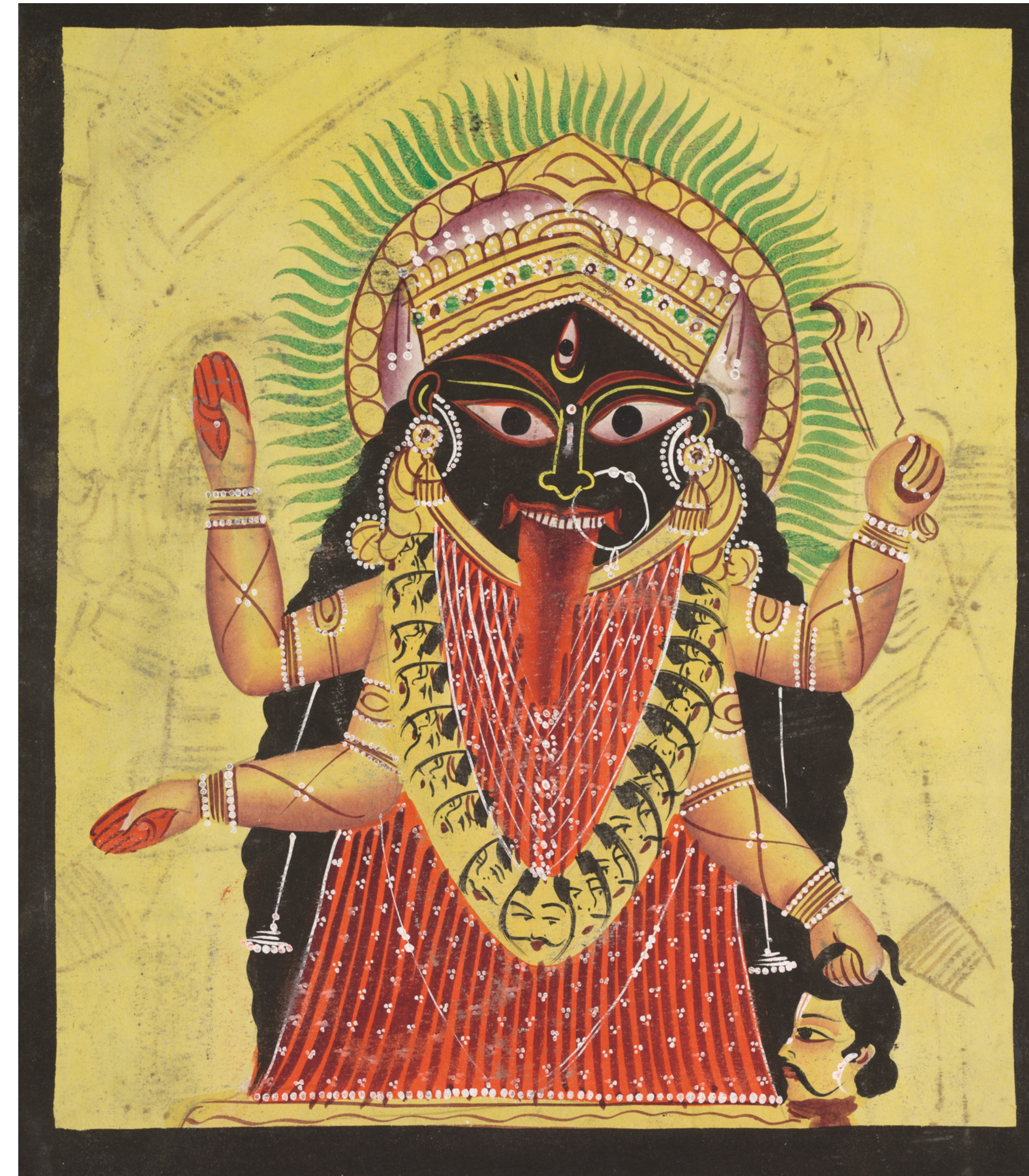
Fig. 3: Kali Enshrined (verso), from a Kalighat album c. 1890.

Her main temple, Kalighat - located in Calcutta - was a major center of anti-colonial activity. A popular school of painting emerged adjacent to the temple. The Kalighat artists' are best known for their mass produced, affordable, pilgrimage paintings of the sacred image of Kali worshiped within the temple. The Kalighat painters, as demonstrated by the album leaf from the Kalighat album, helped popularize this specific, iconic image of Kali. This emphasizes her lolling red tongue on which she bites down, her three eyes, and amorphous body. The red palms, a reference to Parvati and the makeup that married women wear on their hands, emphasize that Kali is an avtar of Parvati, the consort of the Hindu god Shiva.