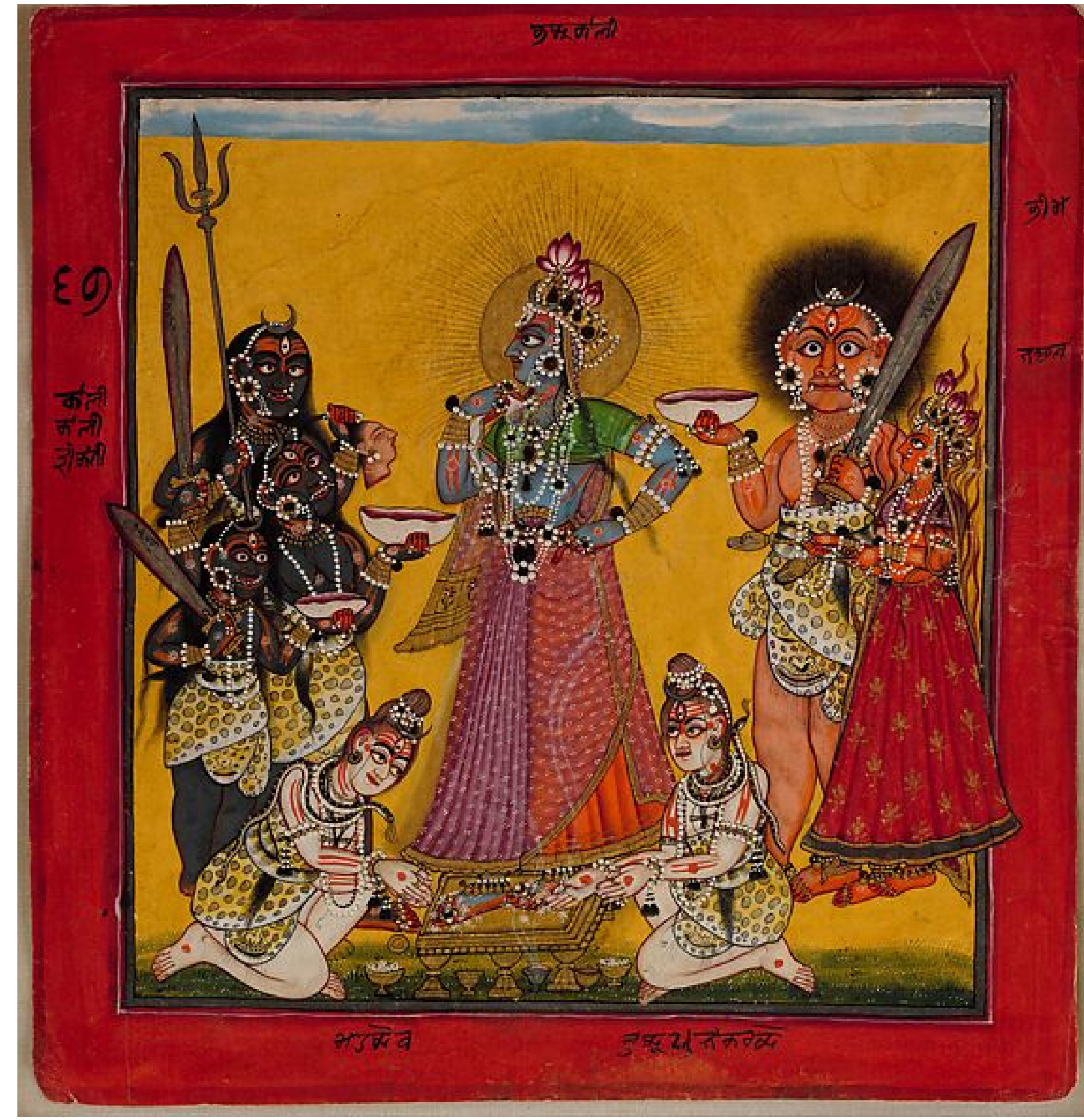
Fig. 2: Devi in the Form of Bhadrakali Adored by the Gods, folio from a dispersed Tantric Devi series.