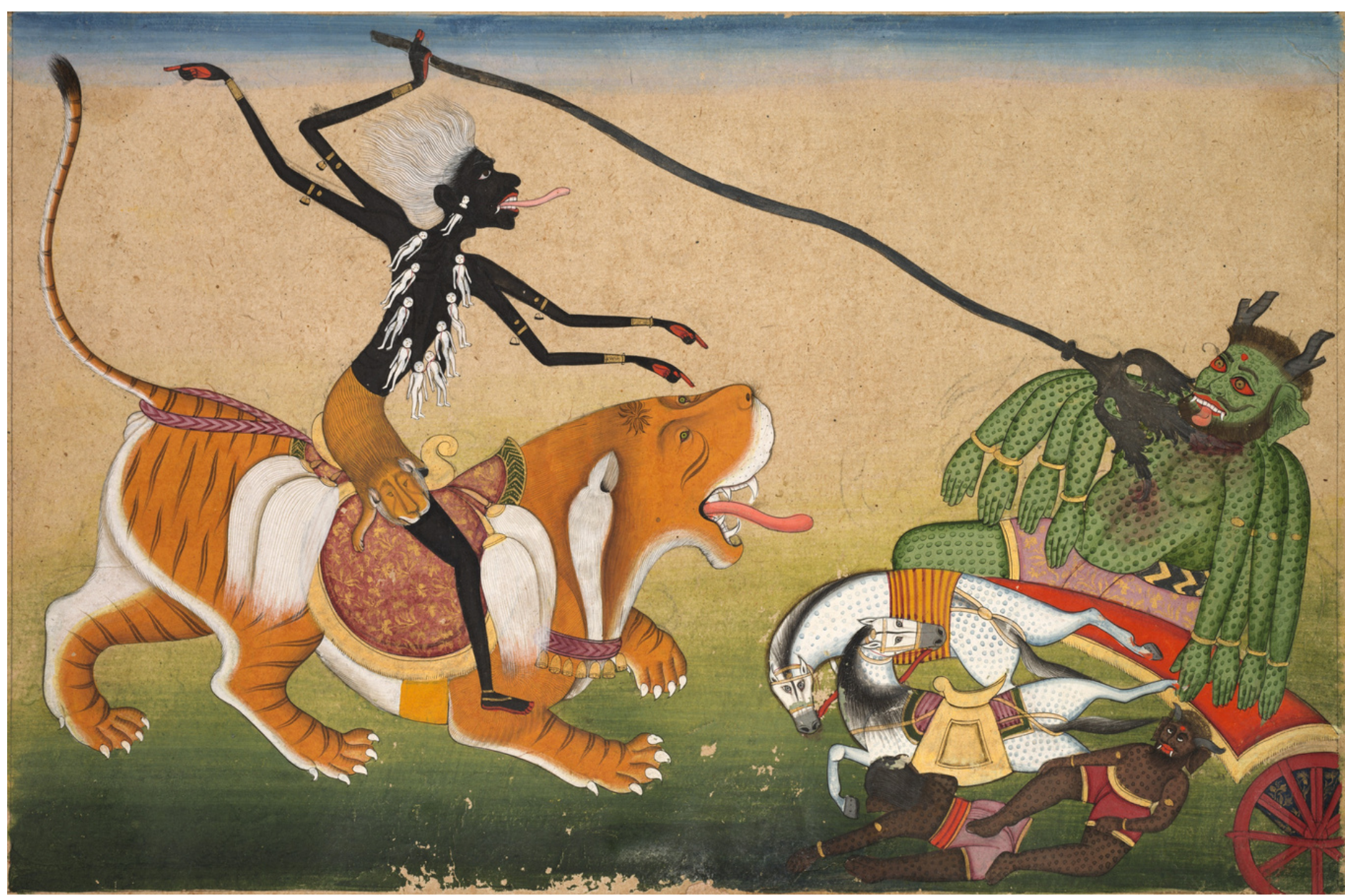
Fig. 1: Kali Attacking Nisumbha c. 1740. India, Pahari, possibly Guler, 18th century. Via the Cleveland Museum of Art.

A complex and paradoxical Hindu goddess, Kali's name means both 'black' and 'time' in Sanskrit. Her iconography includes dark blue-black skin, and she is the destroyer of time. She is worshiped as mother, warrior, destroyer, and provider. She is most commonly understood to be a goddess who 'encompasses and transcends the complexities of life'. Texts and artwork depict her as terrible, with four arms brandishing weapons, disheveled hair, a garland of heads around her neck, a skirt of severed arms around her waist, but otherwise naked. Kali has deep blue or black skin, often with three red eyes and blood dripping down her face, and standing atop the Hindu god Shiva. Sometimes, as in this illustration from the 18th c. Northwest Indian Devi Mahatmya (6th c. CE), she is clad in animal skin, and adorned with corpses. She offers an unusual anti-feminine aesthetic, with many feminine features emphasized alongside her adornments.