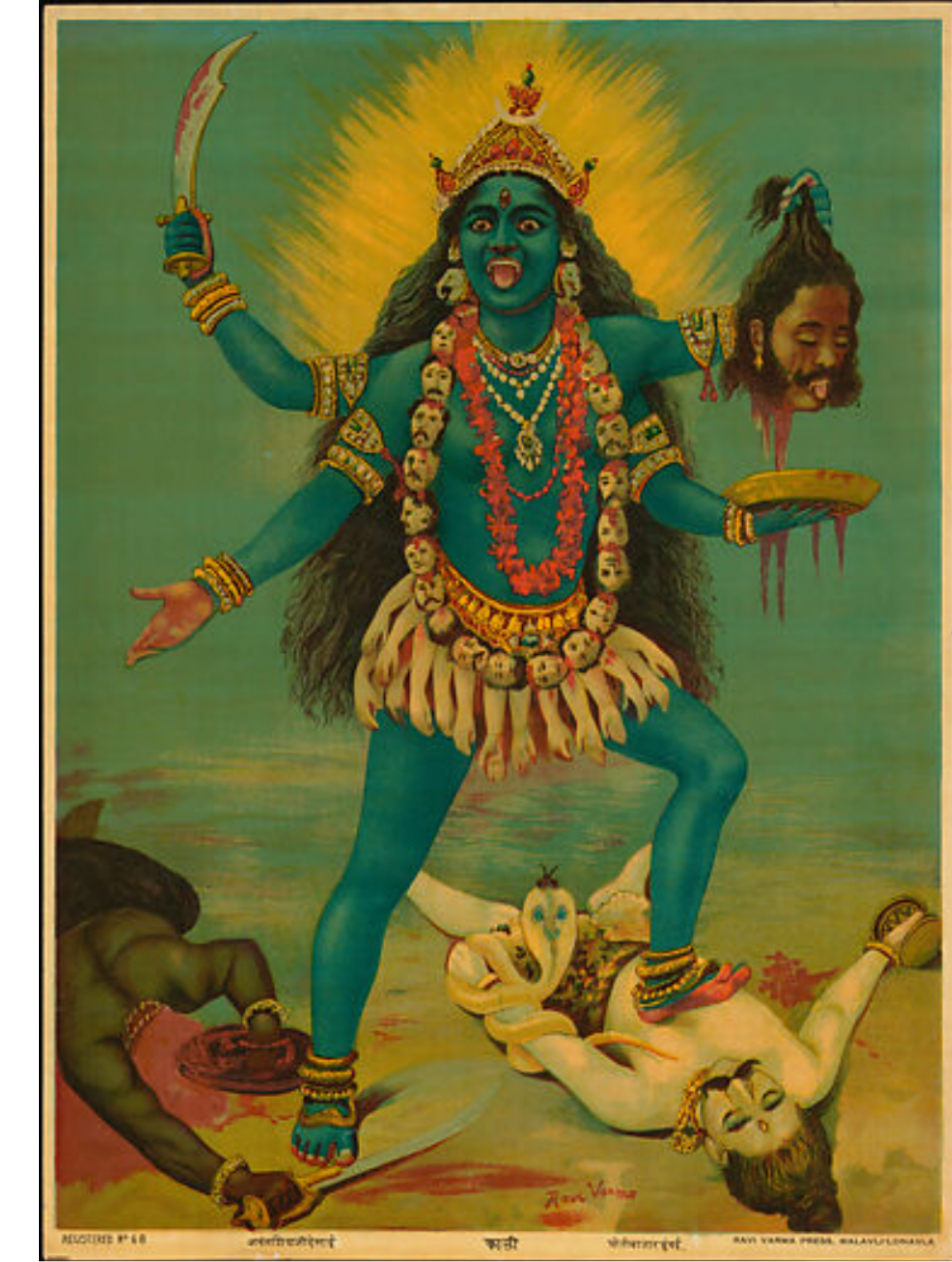
Fig. 4: Kali, 1910-20.