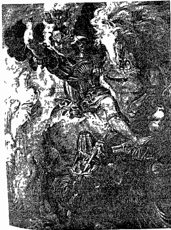
Figure 1: Peter Paul Rubens, Saint George and the Dragon 55

paradoxes) that break structural paradigms, notably the traditional polarized gender roles played out in this rescue legend. On many levels, the traditional main heroic figure of Perseus fighting the dragon is inverted and diminished (for example, by posture, use of recessive colours, vague perspective, and relegation to the background), while the femme fatale Andromeda is