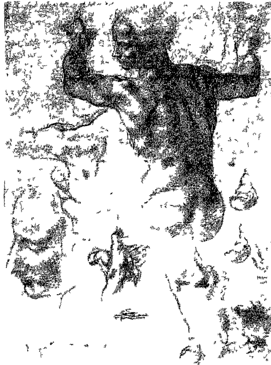
Figure 4: Michelangelo, Drawing of the Libyan Sibyl 87

Berlioz grew to revere Michelangelo during his stay in Rome in 1830, following his award of the Prix de Rome . He spent many hours installed in a pew of St. Peter's, alternately looking down to read Byron or looking up to absorb the visions of Michelangelo's gigantic masterpieces above him ( M , 139). Dubbed by his contemporaries as Il Divino (The Divine