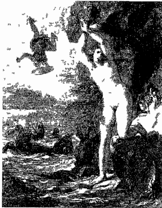
Figure 2: Eugène Delacroix, Perseus and Andromeda 57

These paintings illustrate several artistic criteria that correspond with Berlioz's promotion of the Eroica . the transformation of traditional techniques and images of antiquity synthesized into an original and unconventional personal style; bold new expressions of violence and dramatic action; and form as an organic, expansive process. These paintings also illustrate how Berlioz's