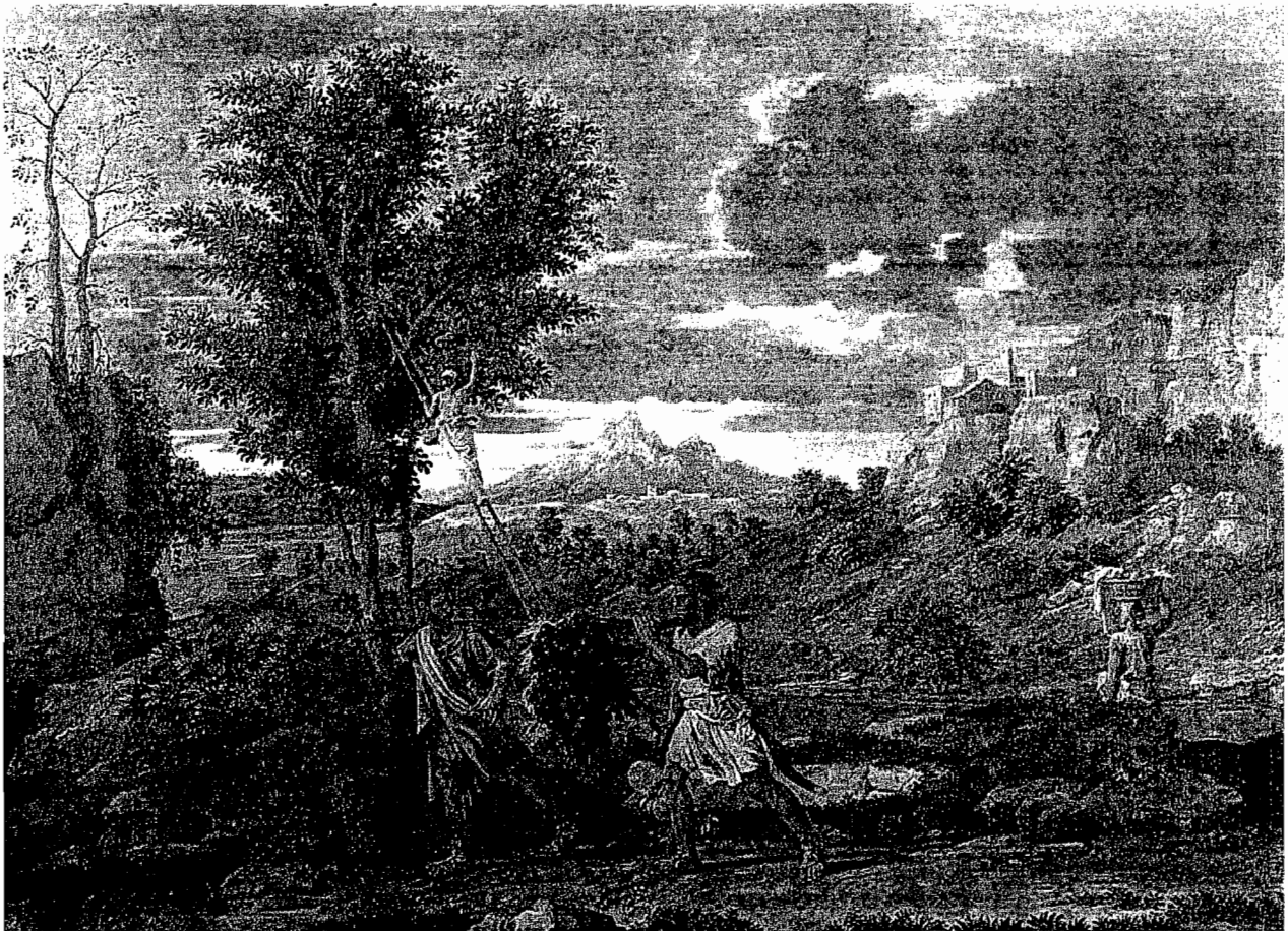
Figure 3: Nicolas Poussin, The Grapes of the Promised Land 85

typically austere beauty, as illustrated in “ The Grapes from the Promised Land ” (representing “Autumn” from his “The Seasons” series, 1660-4; example 3). 84