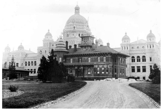
Image: View of the legislative buildings with the old buildings in the foreground

Construction of the new Parliament Buildings in Victoria, designed by architect Francis M. Rattenbury, began in 1893 and was finished in late 1897. The official opening occurred February 10, 1898. Peter O'Reilly arrived in Victoria in 1859 and witnessed the completion of the previous legislative buildings known as the "Birdcages".