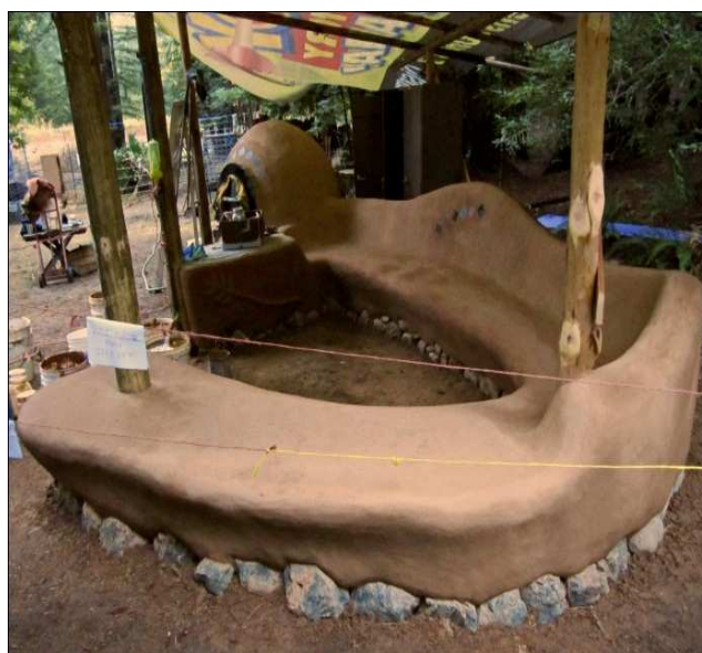
Figure 10: Kata's Bench Project

That's where the table came in for people working at the oven. That's where the alcove came in