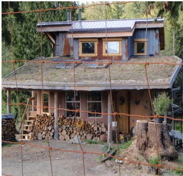
Figure 5: Elke's House/Studio, O.U.R. Ecovillage

The design – just beautiful. It's the most beautiful natural building.