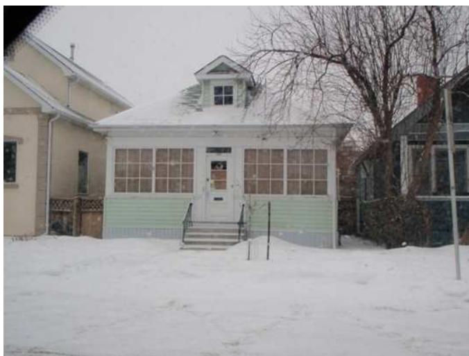
Figure 2: The House my Great-Grandfather Built

The house, made from material milled locally, made using hand tools – no power tools,