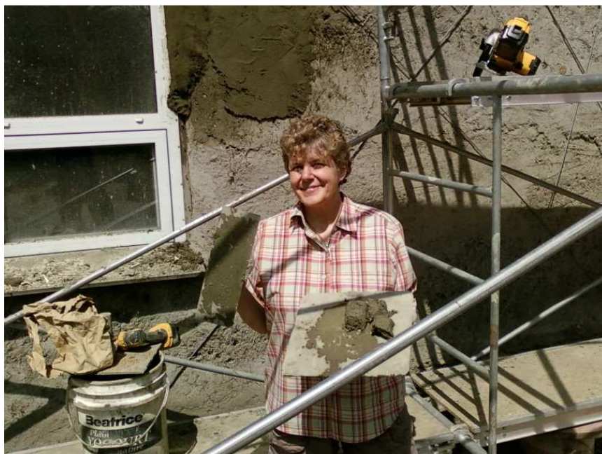
Figure 1: Me Applying Plaster to the Robinson's House