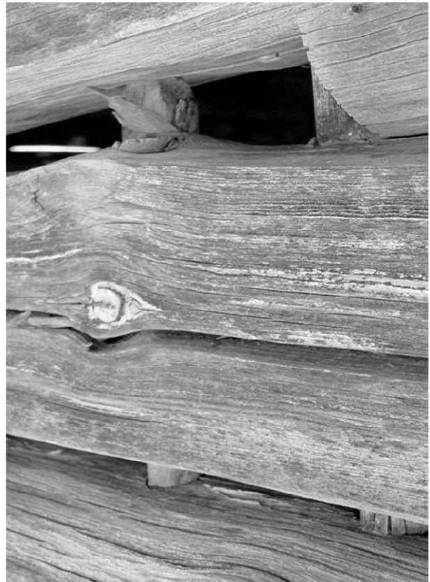
Figure 3: Cabin in Alberta

The cabin needs no plastics or metals. Corners interlock. Pins secure beautiful weathered wood beams. You can take this cabin apart. You can use it for something else.