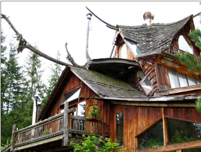
Figure 15: SunRay's House (SunRay Kelley, n.d.)