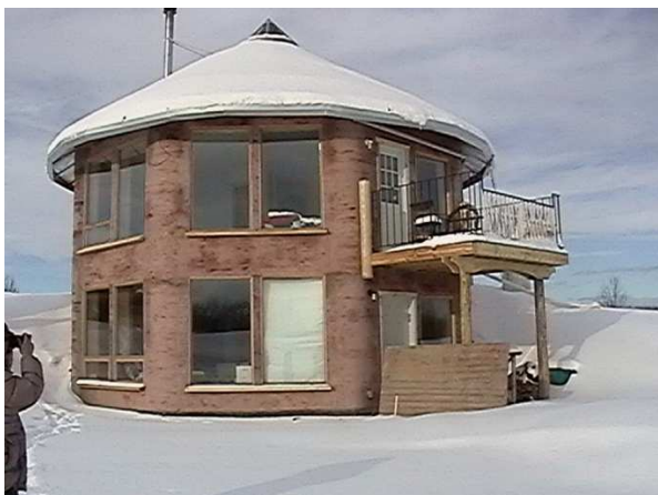
Figure 4: Straw Bale, Edson, Alberta