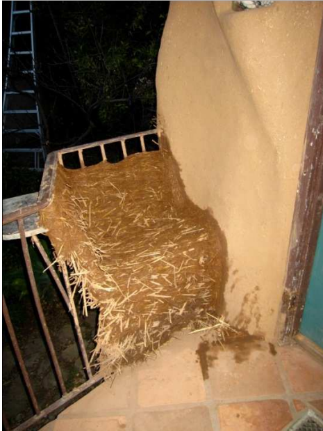
Figure 13: Clay Wattle over Metal Railing