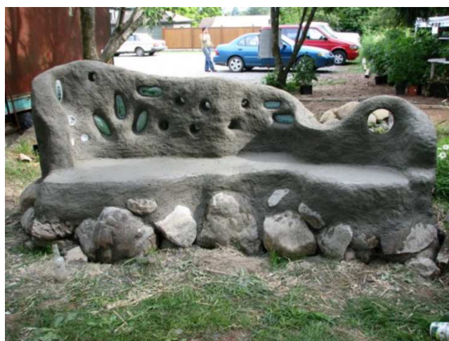
Figure 8: Finished Bench, Nanaimo Community Gardens