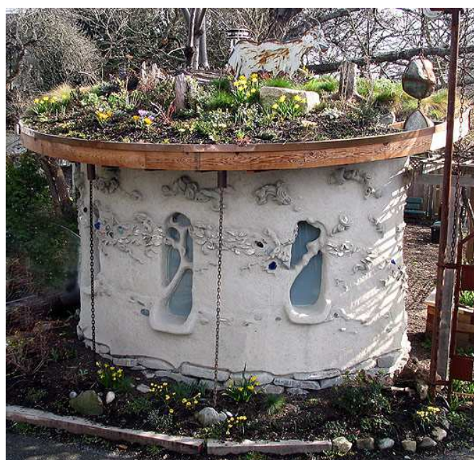
Figure 11: Kata's Favourite cob (City Farmer, 2010)

Glass shards for windows surrounded, sculpted with cob beauty in reuse.