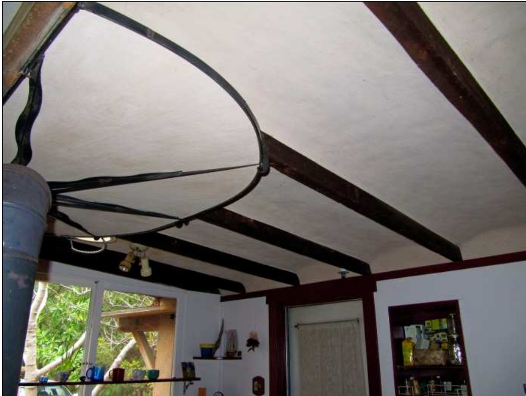
Figure 14: Domed Clay Plaster Ceiling