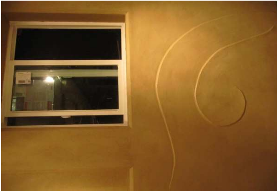
Figure 12: Plaster over Drywall, Duncan, BC