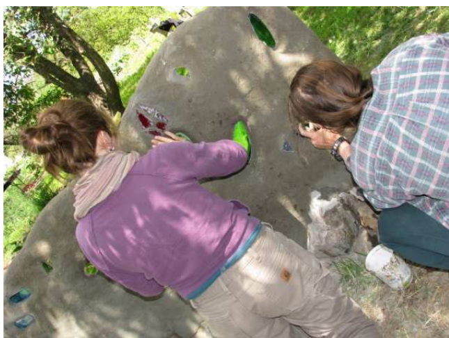
Figure 7: Rose's Bench Project

Whether it's nature or culture, both genders tend to be a little different around each other. When a member of the opposite sex is around, we might just have a slightly different behaviour pattern—especially in learning. Building is typically a man's job. There are lots of women in conventional building, and there are lots of women that work with men. We [the Mud Girls] worked with and learned from men. We just felt that we wanted to see what it was like, and what we found is that we all thrive in a women-only environment. Quite a few of us tend to pull back a little bit when a man is around or maybe defer to his opinion, and we didn't even want to have that be a part of it. We wanted to develop our own skills. As a women-only collective we have a safe space to do that in because we – whether men are judging women or not – women might perceive they're being judged. I know these are generalizations, but I know a lot of people of both genders can relate to maybe not feeling a 100 percent comfortable, being their full selves, and making mistakes, and feeling like they can make mistakes and keep going, when they're around certain types of people. Members of the opposite sex can be people who trigger that. ... So we hire men; we've been hired by men, but as our core meeting collective and as our core working collective, we have all thrived and grown and learned so much as women.