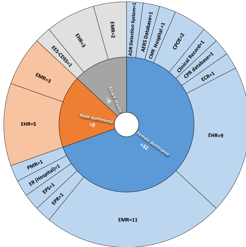
Figure 3- Studies by Outcome and Electronic Record

Figure 3 shows types and times of using different “Electronic Records”, in studies according to their outcomes in sex-dominance.