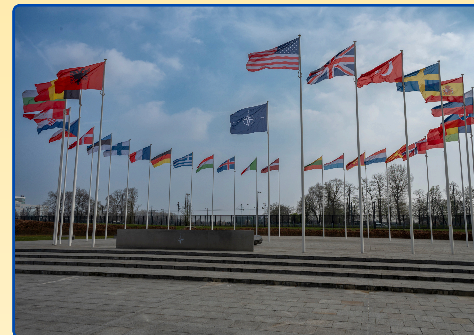
Member flags at NATO Headquarters