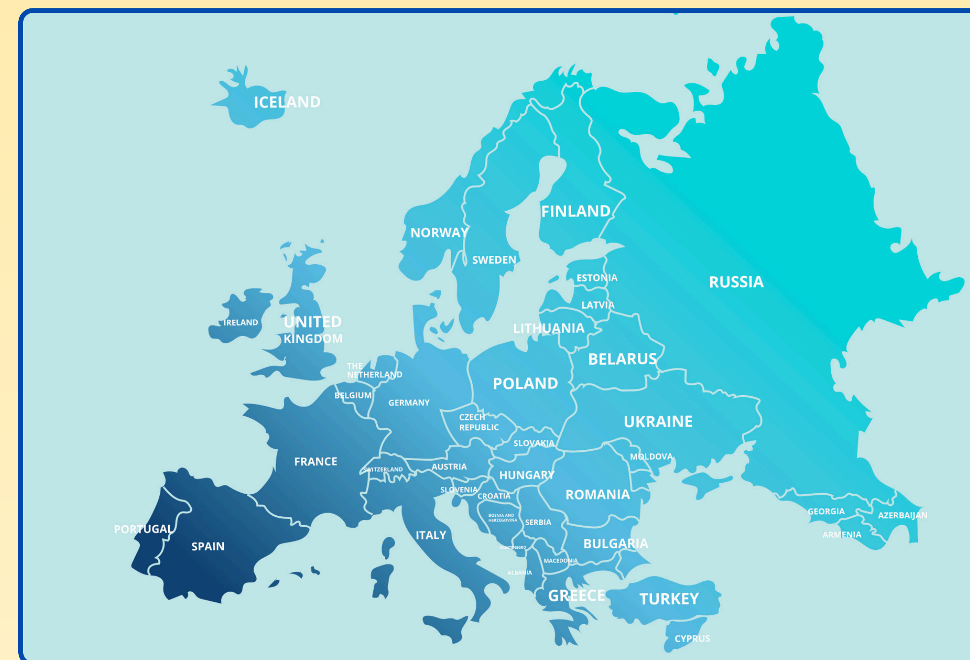
Map of Europe