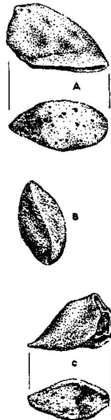
SNAPPING TURTLE CAUDAL OSTEODERMS

Nonetheless, the nature of osteoderms makes them very resistant to destruction and, in those Canadian faunal samples where they appear, they permit a species-specific identification that may sometimes prove quite useful to the zooarchaeologist.