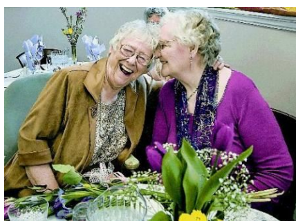
Figure 3. Wedding