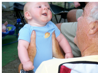
Figure 1. I-Thou

some of the kids might listen, especially if the teacher shushed them and frowned. If you actually brought the little creature and told about him while the kids got to see his liquid black eyes and funny round ears, and feel his silky softness, they would remember that for a long time. They may even try to tell about it at supper that night, but it would lose something in the translation without the chinchilla actually being there.