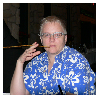
Figure 4 Boy or Girl