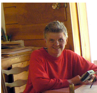
Figure 2. Androgynous

“I want you to look at the next three slides (figures 2-4 as a tryptic) and describe what they tell you about sex and gender.” The group rustles as sheets of paper are hastily drawn from backpacks and briefcases.