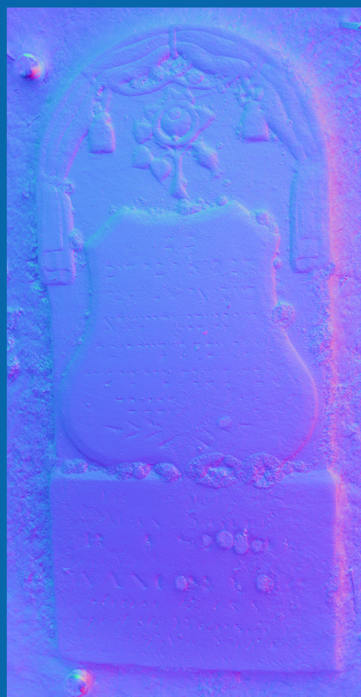
A normal map of the same monument generated via RTI