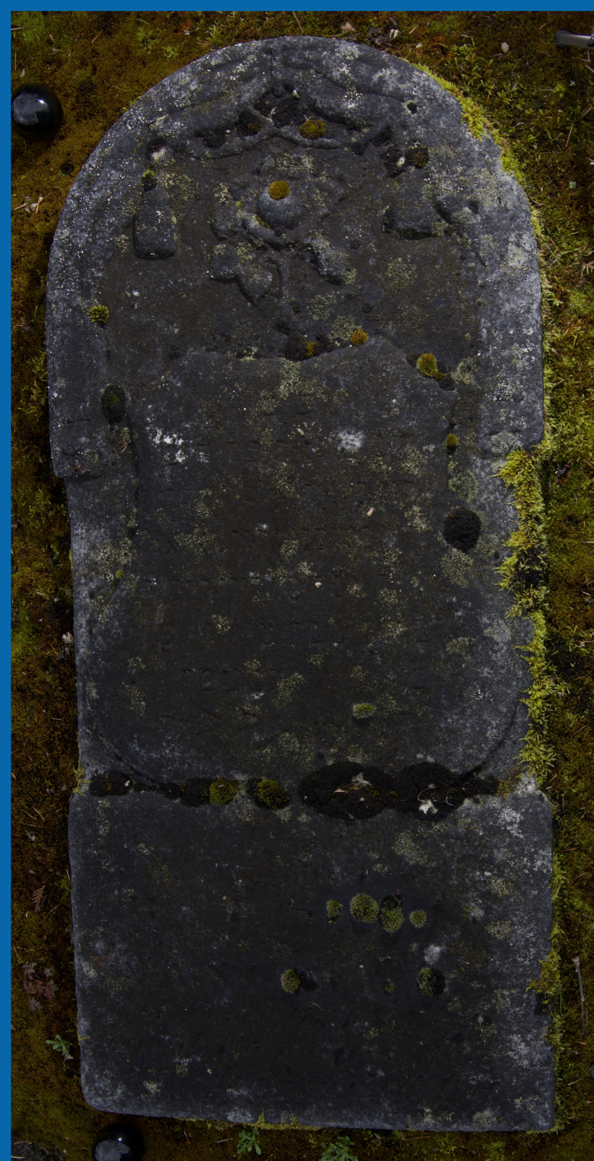
A top-down photo of a monument with no visible inscription

Virtual RTI will one day be the gold standard in the field of cemetery conservation, but traditional RTI will continue to reign supreme for the time being.