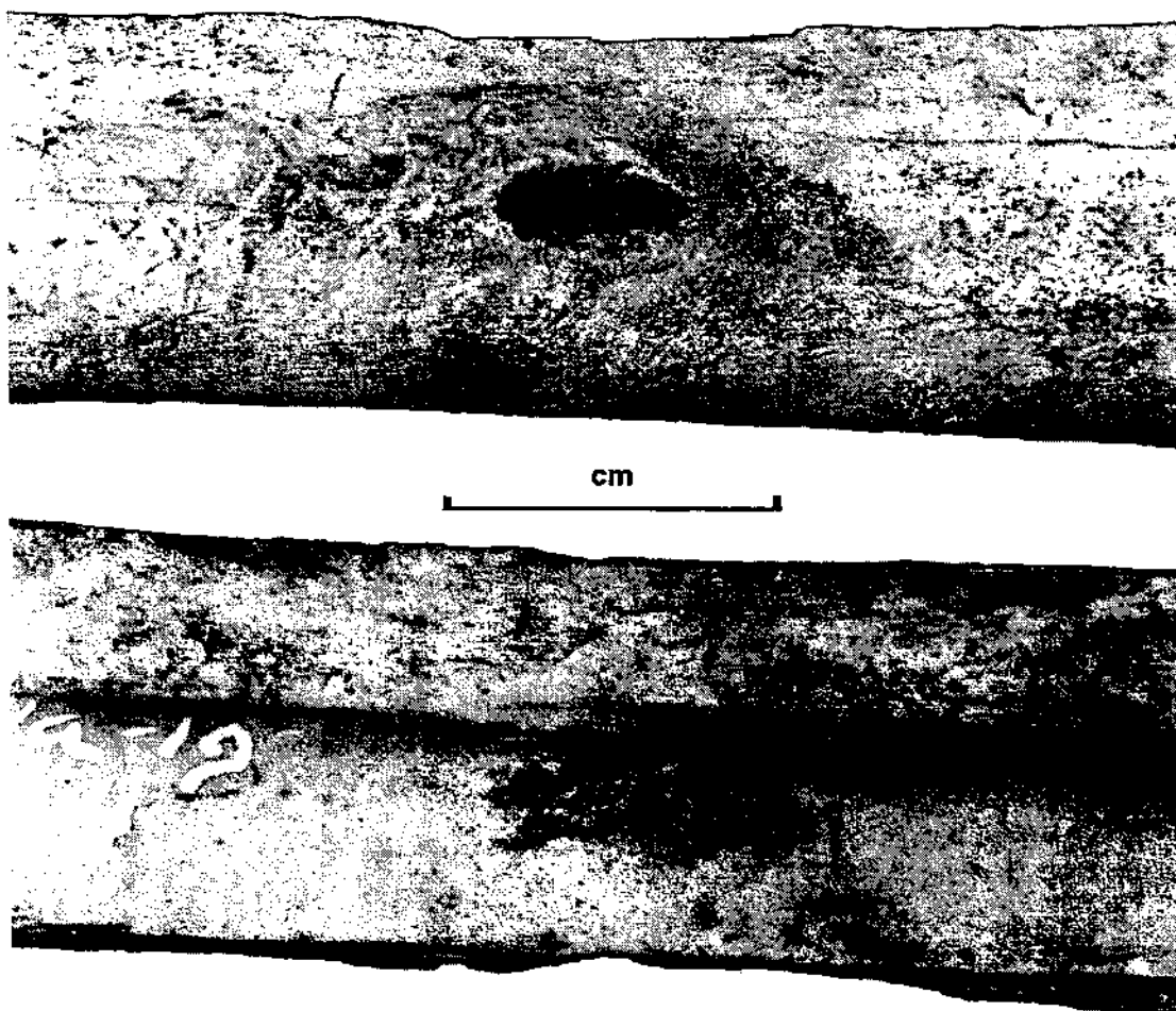
Figure 2. Closer view of injury. Above - exterior surface. Below - interior surface.