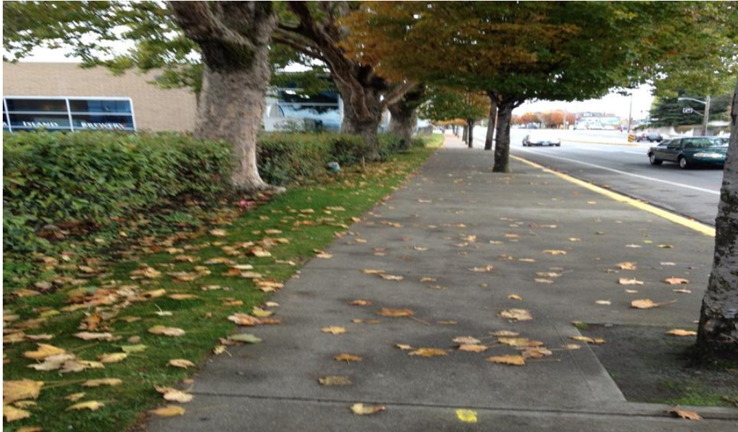
Figure 1- A Long Road

Behind the need for support and a sense of belonging were feelings of isolation and loneliness which we all discussed in the workshops. These problems are of course well represented in studies of international graduate students' experiences in general (e.g. Erichsen & Bolliger, 2010; Guo & Chase, 2010; Kim, 2010; Myles & Cheng, 2003).