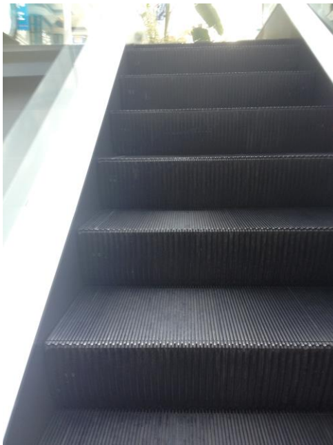
Figure 4- The Escalator

While I was reading the transcripts, I sometimes felt a sense of disappointment and confusion. Participants had such high hopes for GSS before they began their role in that organization, only to be confronted with a dashing of their expectations. Their experiences were different than their expectations. The image below explains this situation: