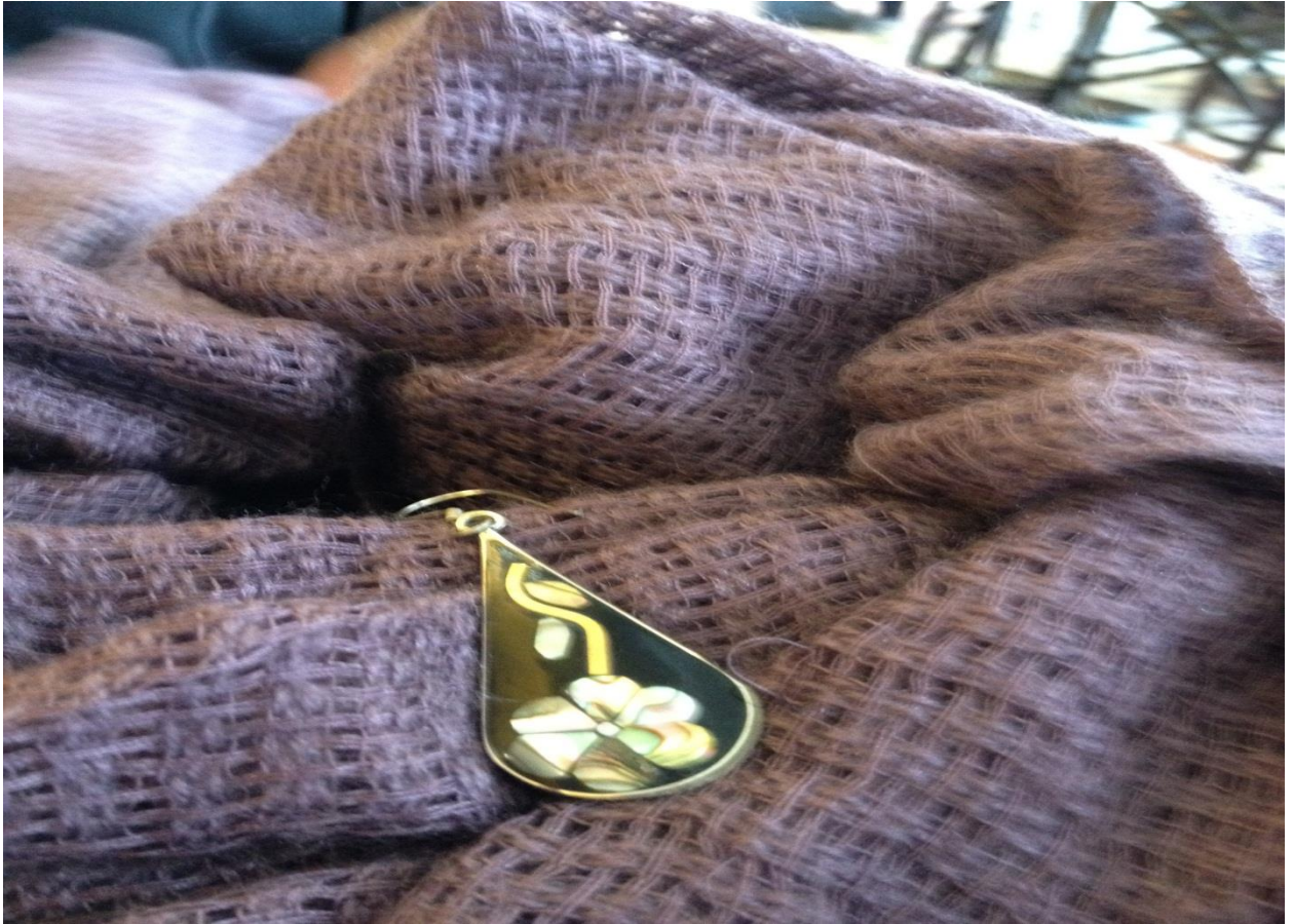
Figure 3- The Earring

It is not so much what is in the photograph, although that matters too, but rather, the ‘art’ of the photograph that illustrates the sense of culture shock, of what I call ‘living out of focus’. If you look carefully at the image, you will note that flower in the earring is upside down. You also note that the image is quite blurry, deliberately out of focus and lacking clarity of detail. Taking this further, the weave gives one the feeling of riding on a rough sea; it is not all sailing on the calm of a beautiful sunny day. Alternatively for Sarah this image metaphorically brings different cultures together; her metal earring from Mexico rests on Y’s soft scarf from China. Juxtaposing of the metal – metaphorically the difficulties and challenges – with the soft fabric – finding