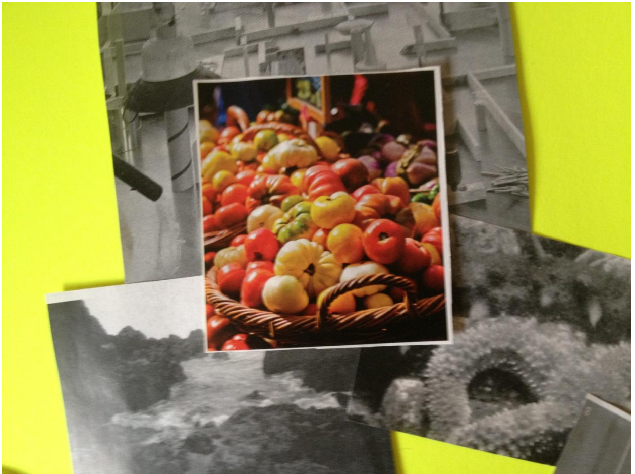
Figure 5- The Colorful Tomatoes

The first sub-theme in learning culture is learning diversity as illustrated in Figure Five below.