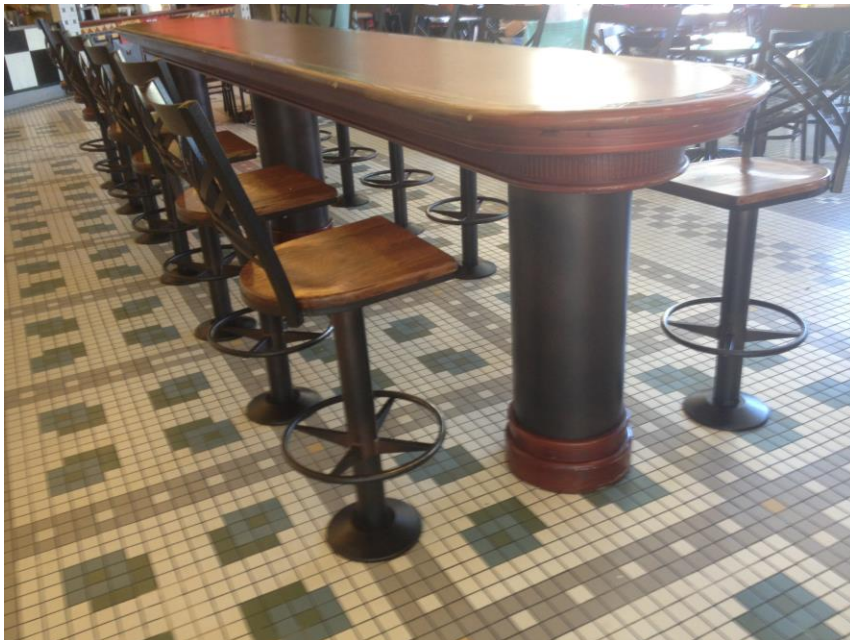
Figure 2 -Table

Figure 2 is an image by “Y”, her chosen pseudonym. While it also speaks to a sense of loneliness, of isolation, it also metaphorically questions our place and role within the leadership of GSS.