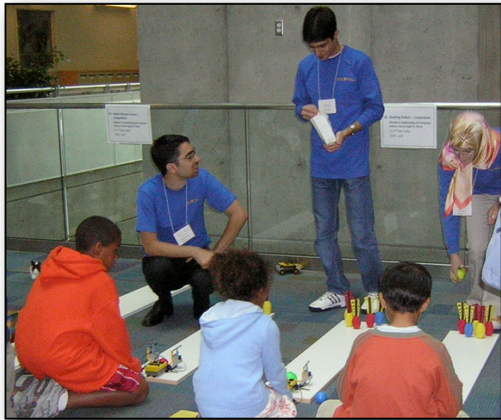
Volunteers assist with an outreach activity involving programmable mechanical LEGO robots.

Among our initiatives, Lego Mindstorms workshops (in which children build and program toy robots) have engaged over 1300 children across BC in the past two years and have received significant media attention [17, 18] in the form of newspaper articles, radio interviews, and television news-broadcast stories. Additionally, recent international collaboration in SPARCS' efforts have been reported in a German newspaper [19]. The media attention has provided WECS (Women in Engineering and Computer Science - the precursor to SPARCS) and SPARCS with a tremendous amount of visibility, leading to enhanced public interest in our initiatives. This public interest has taken the form of both increased enrollment in workshops, as well as increased interest in volunteering to help coordinate and run workshops and other initiatives. The media attention has also brought an increased sense of responsibility towards the public in terms of the consistency in quality that we deliver, and the image that we as an organization portray; meanwhile, the support infrastructure that SPARCS has developed allows us to deliver the level of quality required to maintain the public trust developed.