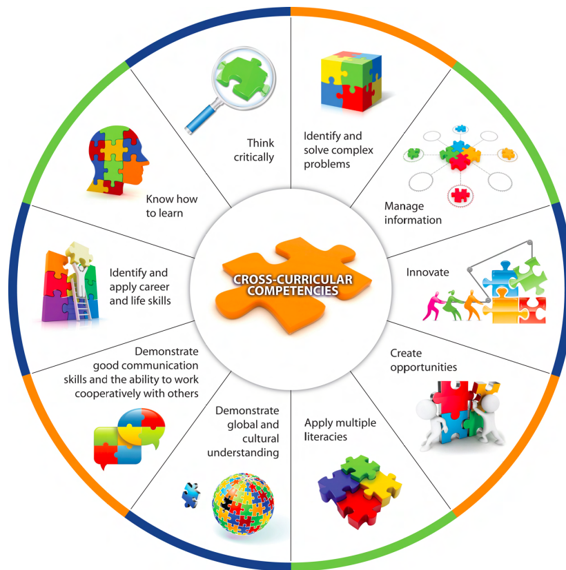
Figure 1. Cross-Curricular Competencies Alberta Education (2010).

Alberta Education has made an emphasis on positive relationships, which falls into 21 st Century learning and is seen on the cross-curricular competencies chart.