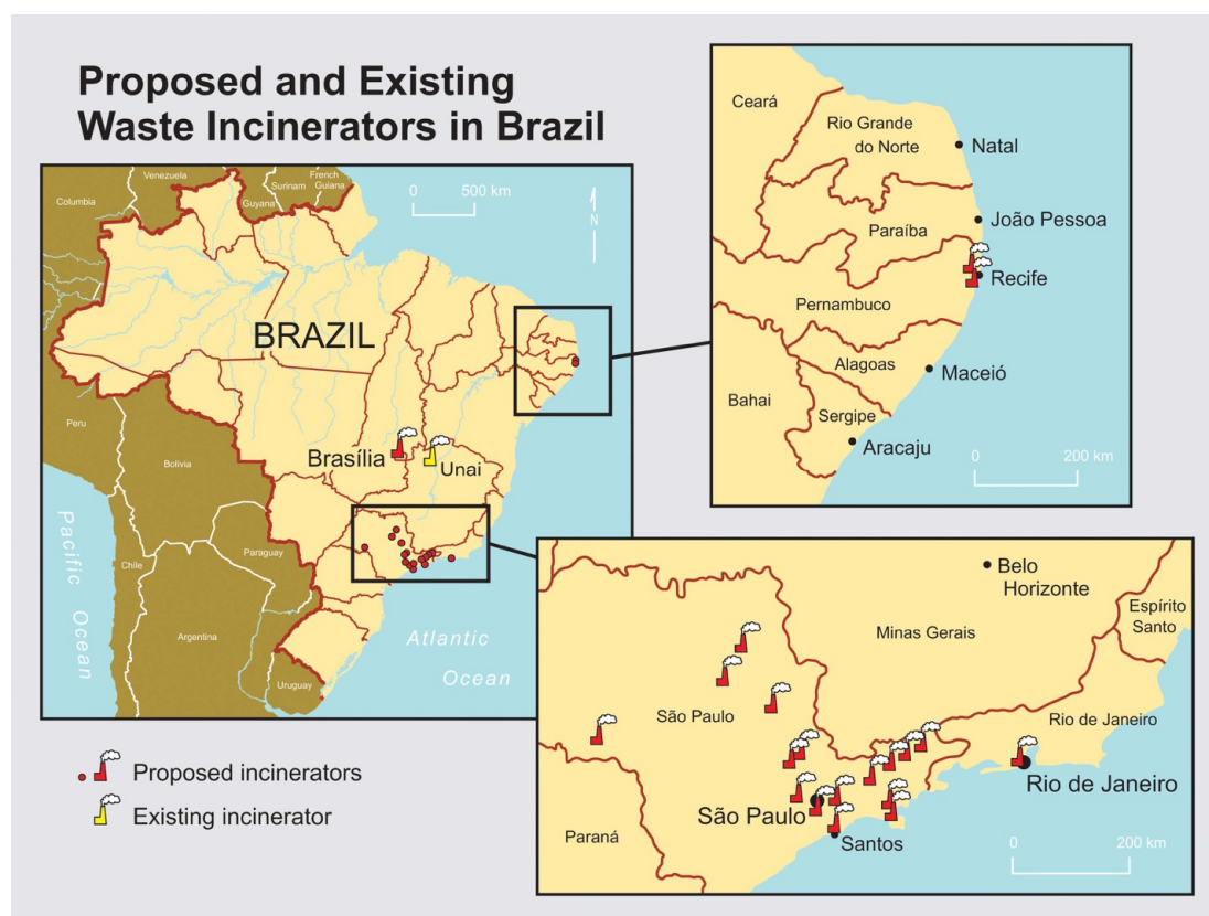
Figure 1. Proposed and existing waste incinerators in Brazil.