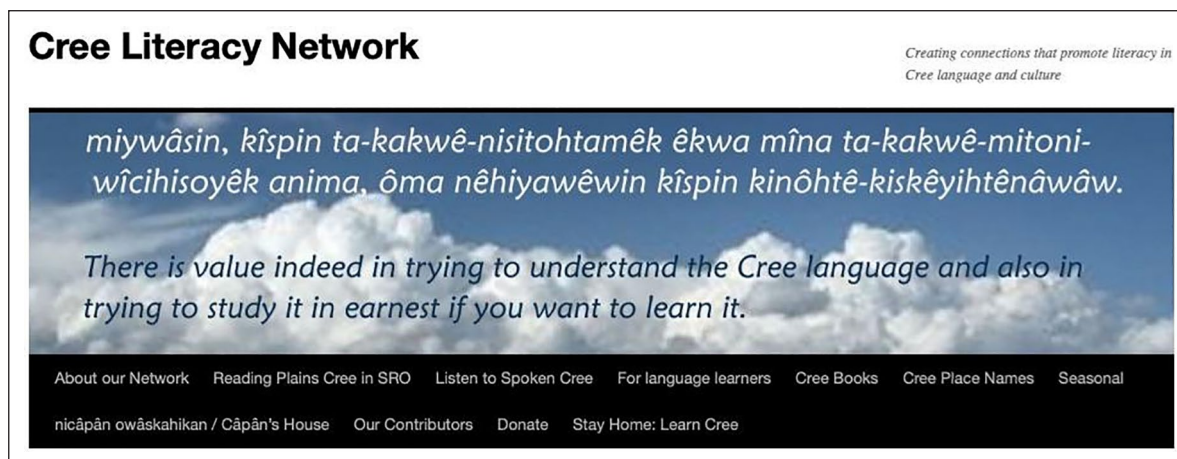
Figure 1. Cree Literacy Network (creeliteracy.org).

virtual. However, the global crisis halted all in-person language work other than what was possible within one's own family "bubble" and pushed efforts online. Here we will share with you what has occurred within our language group. We used a free online tool called Padlet.com to collect and analyze (a) pre-COVID language activities (both online and face-to-face), (b) shifts we witnessed due to the inability to gather in-person and, finally, (c) new initiatives that occurred in response to the pandemic. We hope by sharing the resilience and innovation shown by our language advocates, learners, teachers and speakers that others may see themselves here too, draw inspiration from successes we have had and together we can continue moving forward with our language work during this difficult time.