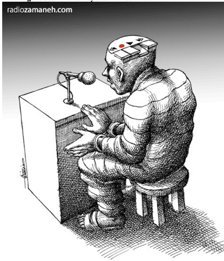
Figure 3. 1- Mana Neyestani: I Confess. 281

But let us continue in theatre, for it is in this language that the absurd begins to appear. The stage entrance, and thus the transfiguration of figures such as Hajjarian, Abtahi, and Atrianfar, (for Derrida reading Marx, commodity turned spectre, and for us, man turned commodity turned spectre) marks the “apparition of a strange creature: at the same time