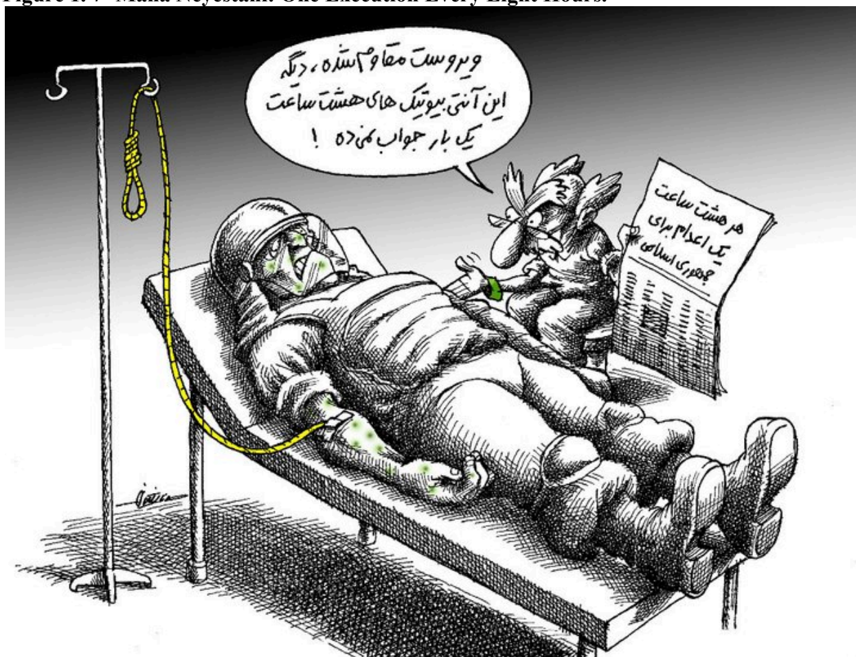
Figure 1. 7- Mana Neyestani: One Execution Every Eight Hours. 89

Bottom/right: “One execution every eight hours for the Islamic Republic.” Top/left: “Your virus has become resilient, these once-every-eight-hours antibiotics are no longer effective!”