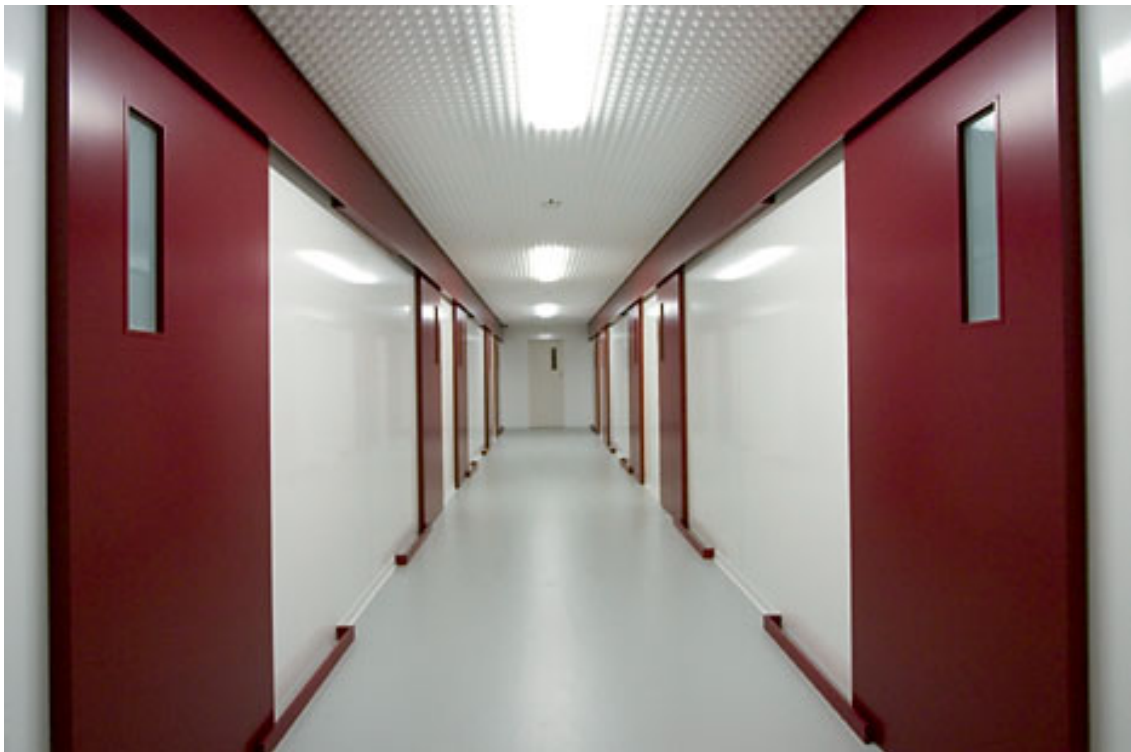
Figure 1. 1- Gregor Schneider: White Torture Exhibition.

inside in which one is caught up, without even a glimpse possibility of an outside. 59 But this inescapable space is not one of death, but rather precisely that which preserves the life of both the ghosts and the living. A final thought which a curator leaves us with on Schneider's work: "Does it not seem somehow inappropriate to encounter 'the greatest terror' in the halls of [this] 'beautiful illusion'?" 60