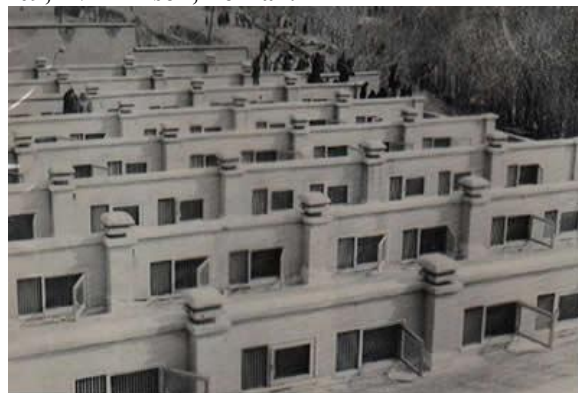
Figure 1. 6- External view of solitary cells, section 209, Evin Prison, Tehran.