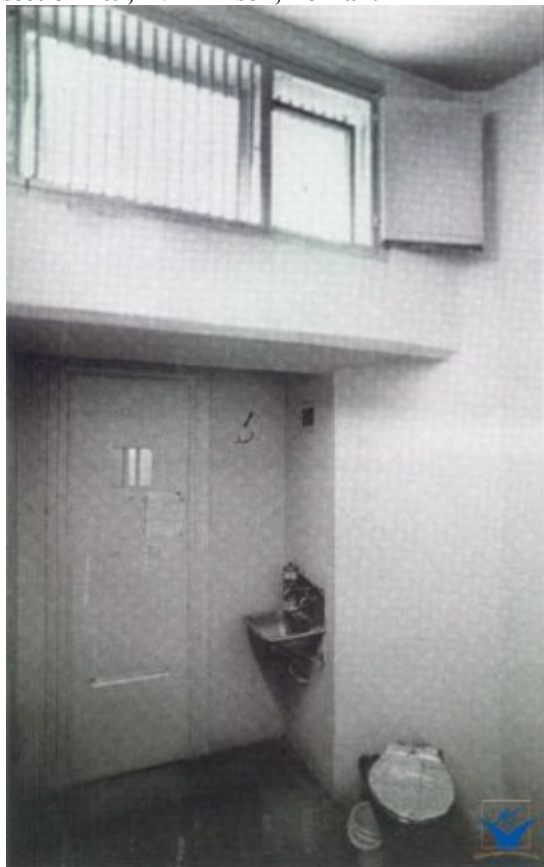
نمای داخلی سلول انفرادی بند 209