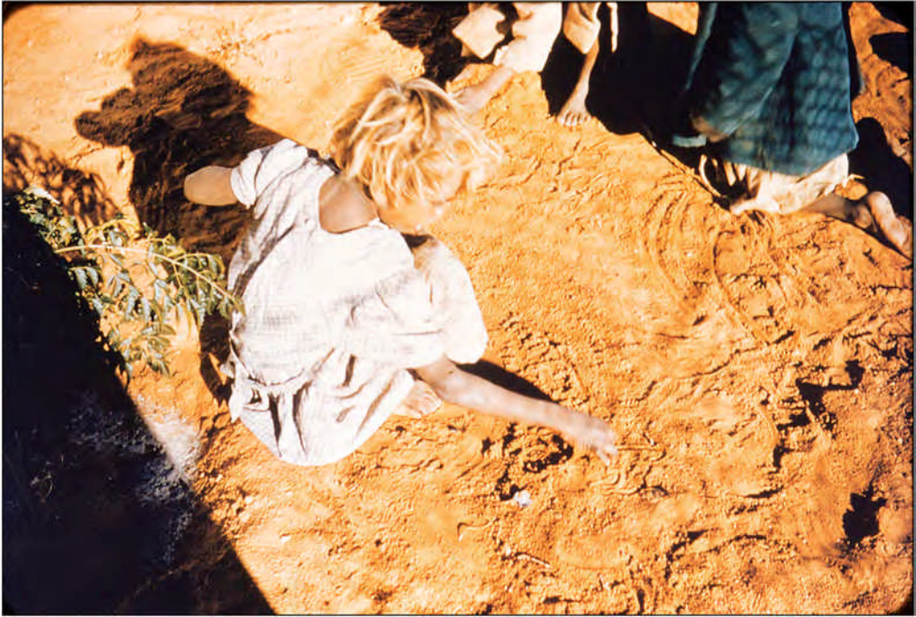
Figure 3. Child creating a sand drawing, Northern Territory, Australia, 1957 (photograph by Gilbert Joyce; image courtesy Library and Archives Northern Territory https://hdl.handle.net/10070/747811 ; photo number: PH0048/0180).

Sand drawings are a form of cultural symbolism used particularly by central desert communities to emphatically relate a story (Nunn 1973; Johnson 2000). They were also noted by Bardon (2000: 208–209) to be a popular medium for children when drawing games in the sand, thus creating various patterns. Myers (2002: 34) found that narrative meanings in everyday conversation are also illustrated in sand drawings by “men, women and children”.