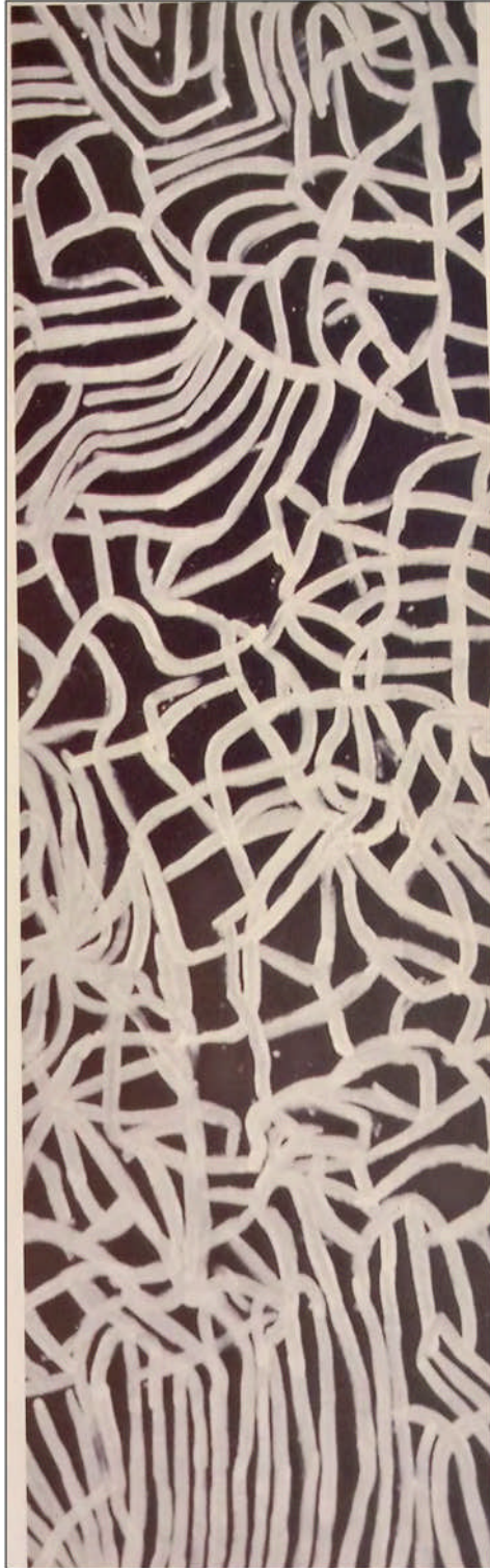
Figure 4. Anuerlarr angameny (Big yam Dreaming), canvas painting by E. Kam Kiguarrayy, c. 1995. synthetic polymer paint on canvas (2911 × 8018mm). National Gallery of Victoria, Melbourne. Presented through The Art Foundation of Victoria by Donald and Janet Holt and family, Governors, 1995. (© Emily Kam Kiguarrayy/licensed by Copyright Agency, Australia; image courtesy National Gallery of Victoria, Melbourne).