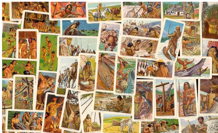
Figure 1. Red Rose Tea cards. Retrieved from http://www.teacard.com/images/collage/colage14.jpg