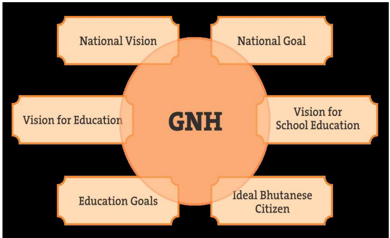
Figure 1. GNH as the Overarching Goal for Bhutan (Royal Education Council, 2012, p. 95)

where there is a balance between modernity and tradition, material and spiritual needs, economic and social concerns, and physical transformation and ecological conservation (Wangchuck, n.d).