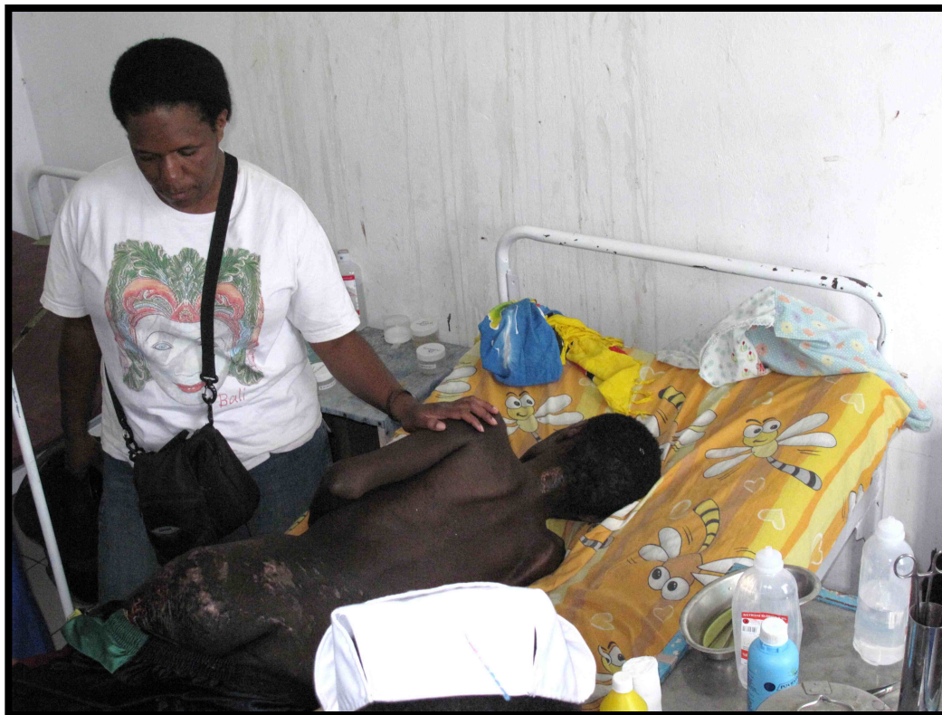
Figure 6: A patient and Dessi in the HIV ward displaying open sores on the patient's body.

Walking into the HIV Ward was one of those experiences that stuck with me well beyond the actual event. All the stories about stigma, AIDS, and working with patients I had heard previously were somehow disconnected from the experience of stigma I witnessed in that small room. The HIV Ward is where death happens for many HIV-positive people and it is a sad and disturbing site. The patients were poorly cared for: it is the culmination of stigma in Wamena. This experience led me to question even more the claim “there's is no stigma here” that I had heard over and over in interviews with healthcare providers, because in the hospital it was clear to me that some people received adequate care and others did not.