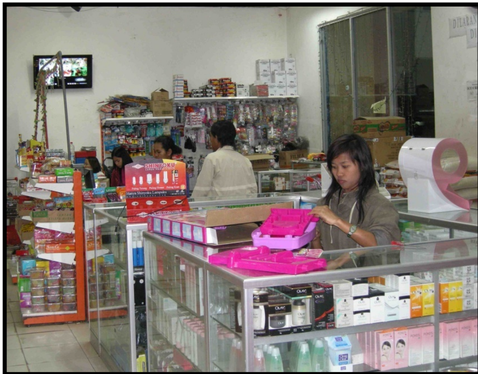
Figure 4: Indonesians working in the local grocery store