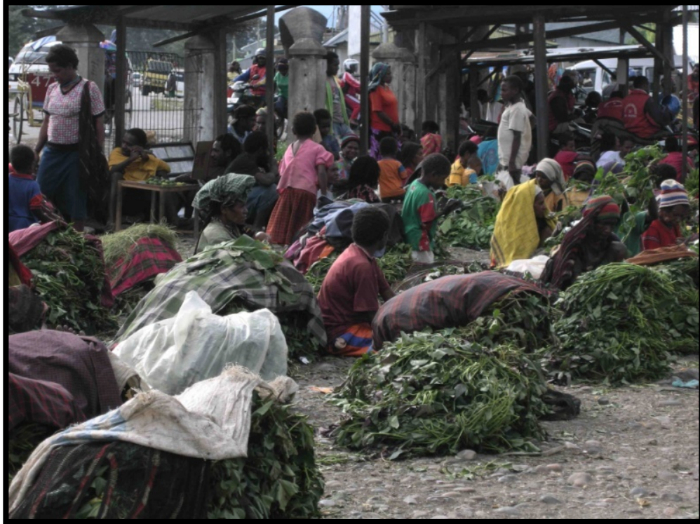
Figure 3: Papuan women and children selling vegetables in the market

newcomer that the Indonesian population is significantly better off than the indigenous population, and that the indigenous Papuans resent this inequity. Figures 3 and 4 show the extreme differences in the workplace and types of goods being sold. Navigating the structural and inter racial relationships of Wamena was a constant part of my fieldwork experience as I negotiated the local clinics and healthcare providers working there.