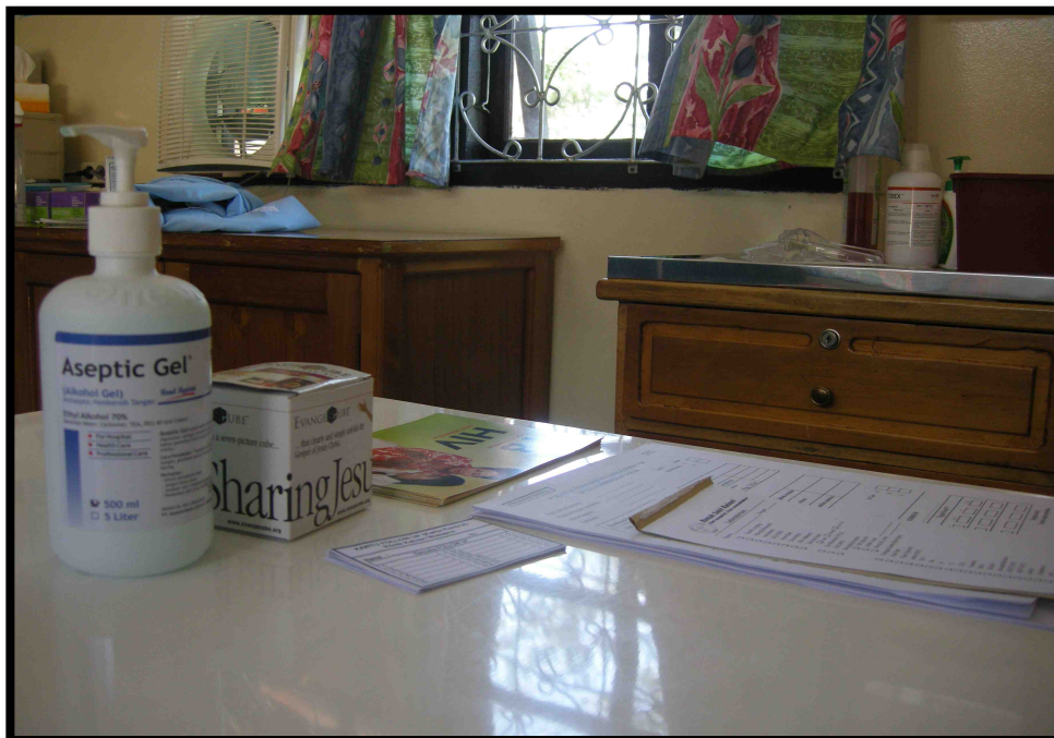
Figure 9: the Evangecube in its package sitting on the medical consultation table

Suster Nari situates herself within familial and religious boundaries. One day in the clinic, I asked about a teaching tool called an Evangecube that was sitting on her desk (see figure 10). The Evangecube is a teaching puzzle that helps people to explain the story of Jesus Christ through pictures that change depending on how you fold and rotate the blocks.