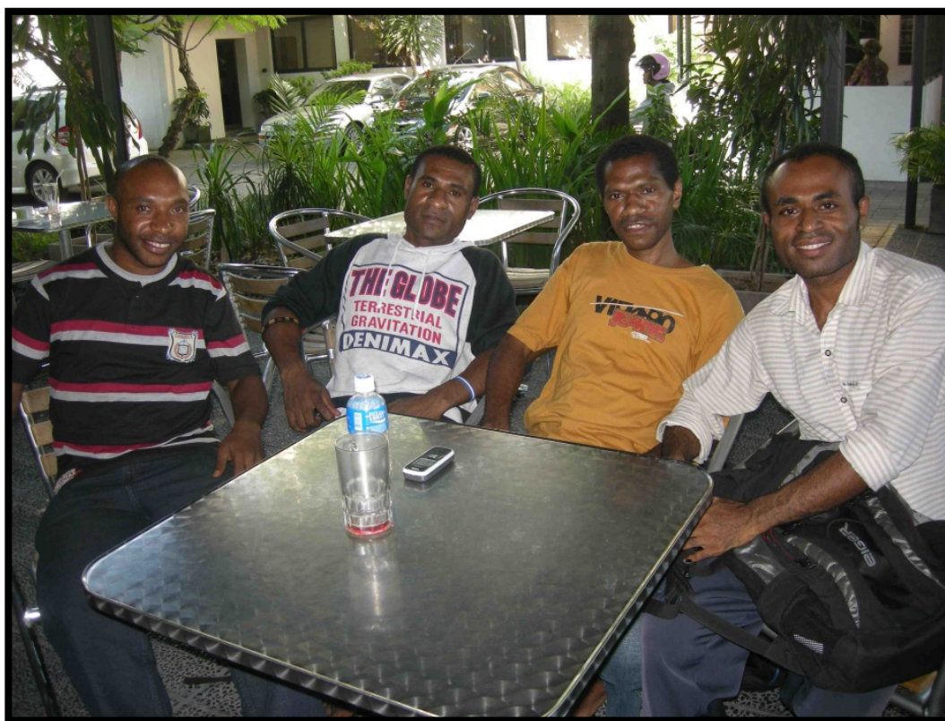
Figure 2: Networking with students in the cafeteria at IALF

where the students and I were able to help build each other's vocabularies while also improving pronunciation and grammar.