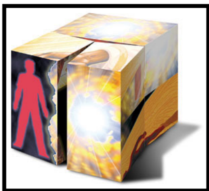
Figure 10: A Picture of the Evangecube outside of the package

The Evangecube is something that is important to me because my husband is a pastor and I am Christian. This is why I have a strong motivation for patients to become stronger; not only their struggles with HIV, but also that, they become children of God. This is a very strong desire for me.