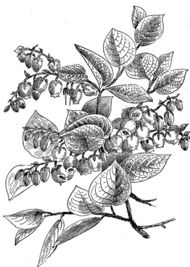
PLATE LXXXVIII. Gaultheria Shallon. (169)

From all of us at UVic Libraries, we wish you health and happiness this holiday season.