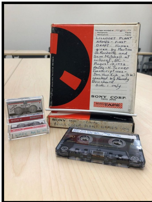
Hand-written recording of Indigenous plant names and associated cassette tapes. These historic records have been digitized thanks to supporters like you.

Digital Initiatives Fund: One of the most valuable resources at the UVic Libraries is our vast collection of digital archives, books and publications. Your gift to the Digital Initiatives Fund allows us to put our collections online. The process of digitization not only preserves critical artifacts, it also creates broad access to information, which benefits our students, researchers, and the community at large.