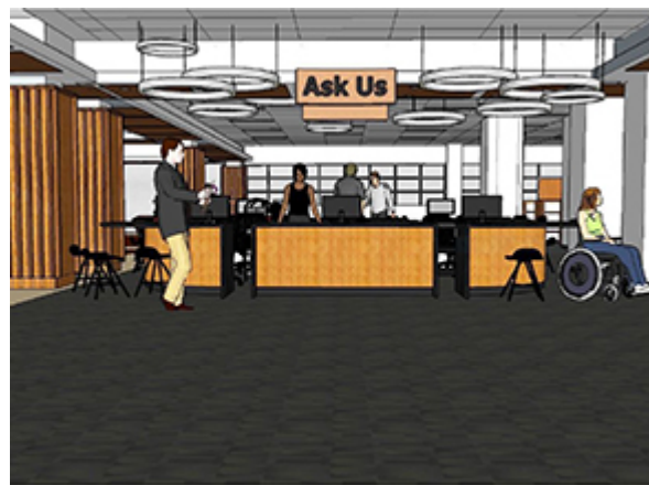
Desk rendering courtesy of Jensen Chernoff Thompson Architects.