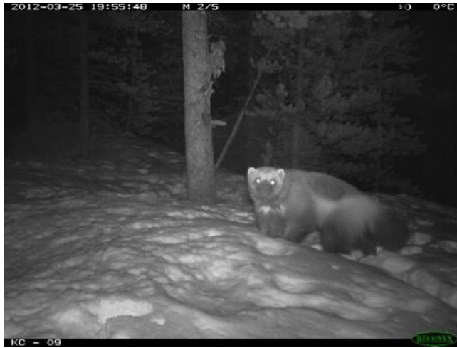
FIGURE 2 Photograph of a wolverine detected using a remote camera trap located in the Kananaskis Country region of the central Canadian Rocky Mountains

At each site, a single Reconyx RM30 or PM30 infrared-triggered digital camera faced the hair trap—a tree wrapped loosely with barbed wire, baited with a frozen beaver carcass and scent lure (O’Gorman’s, Montana, USA). Cameras were programmed at high sensitivity, five images per trigger, 1 s apart, and rapid fire with no delay. We collected photo and hair samples monthly January–April. Our study area was a polygon around the outermost cameras in the array, and the sampling site is the area around the trap potentially imaged by the camera (Burton et al., 2015). The data frame consisted of n = 104 sites, surveyed t = 3 times.