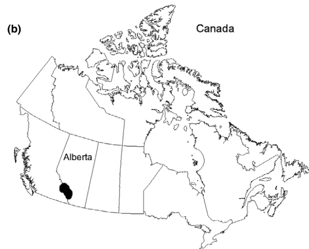
FIGURE 1 (a) Study area map showing wolverine sample sites (black points = wolverine detected, light gray points = wolverine not detected) located throughout the south-central Canadian Rocky Mountain range, extending west-east from British Columbia, through a gradient of protected areas and land management designations that include a National Parks Complex and Alberta Parks Kananaskis Country region, and out along the eastern slopes of Alberta.