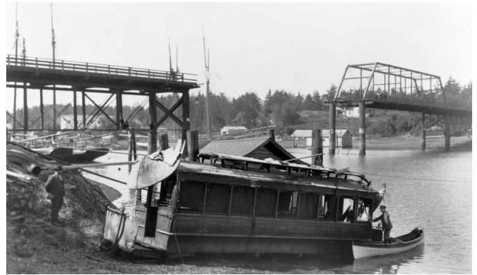
Image: Aftermath of Point Ellice Bridge Disaster, Victoria (BC Archives G-04531, May 1896)

Due to lack of safety standards, poor bridge maintenance, and an overcrowded street car, the Point Ellice Bridge collapsed on May 26 th , a day of Queen Victoria's birthday celebrations. The streetcar passing over the bridge crashed into the water and 55 people were killed. The site was visible from the O'Reilly's Point Ellice property.