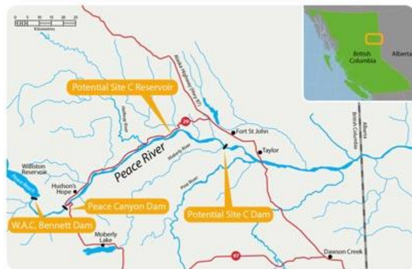
Figure 2: Location of the Site C Dam

The objective of this section is not to provide a comprehensive study of the Site C dam nor the campaign itself, but to provide enough information for the reader to understand the dynamics of the relationships between the ENGOs and Indigenous peoples involved in the project.