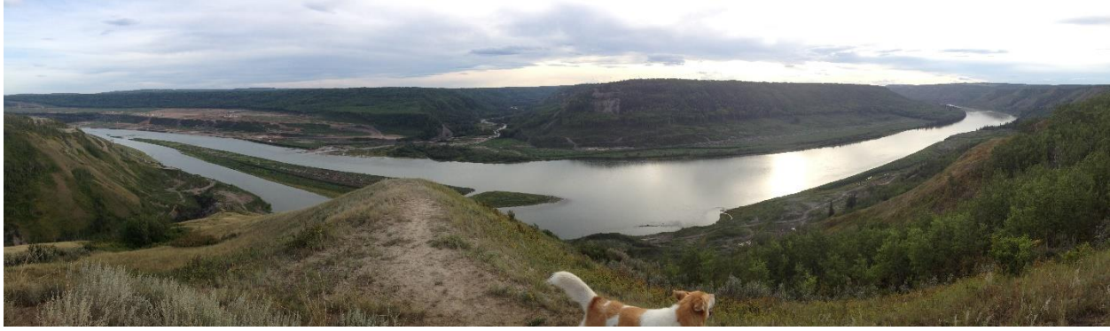
Figure 1: The Peace River and Site C construction Site.

As seen from Protestor’s Point – interview site with Helen Knott. The construction site is on the far shore of the river on the left hand side. August 2016.