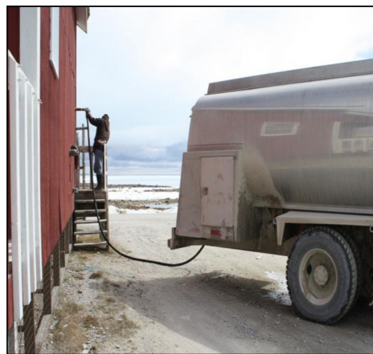
Fig. 1. Tanker truck delivering potable water to house (photo credit: first author).

Household wastewater is stored in a separate tank and pumped out using specialized trucks. The domestic wastewater is then removed to designated stabilization ponds and wetlands (wastewater treatment areas), which are typically located near solid waste disposal areas outside the community to prevent hydrologic connectivity with municipal drinking water sources. In most