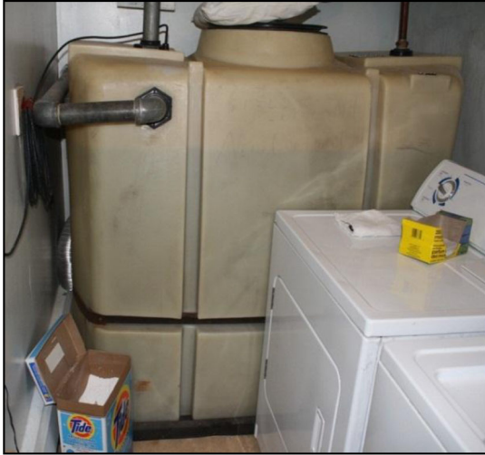
Fig. 2. Potable water storage tank inside house, approximate capacity of 1,200 litres.

communities, if systems are functioning optimally, both water delivery and wastewater pump-out services are provided daily or at least 3 days per week to each home.