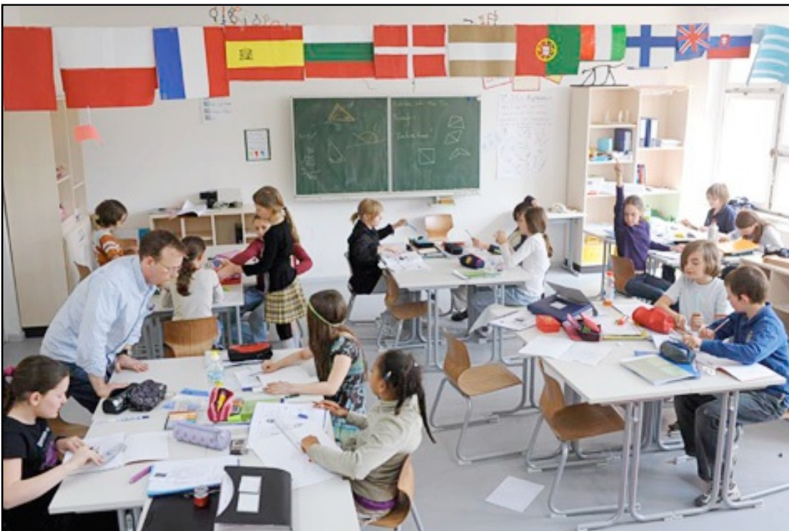
A student-centered classroom setting at Berlin Metropolitan School

With these considerations in place, a number of newer schools that have been built around the Lower Mainland of British Columbia seem to be taking this more adaptive and open approach to the design of their buildings.