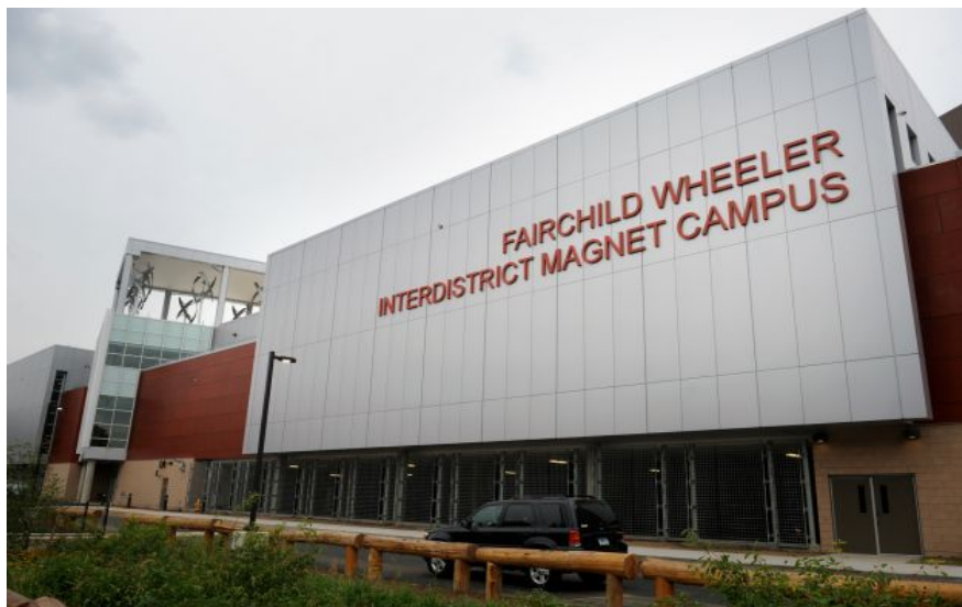
Figure 1: Photo of the front entrance of the Fairchild Wheeler Interdistrict Magnet Campus.