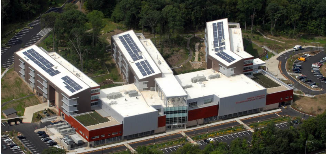
Figure 2: Aerial image of the Fairchild Wheeler Interdistrict Magnet Campus.

While the article went on to detail more about this cutting edge school, I could not help but wonder, why this could not be done right here in our own backyard? Better yet, why not reconfigure what schools look, act, and feel like, by using them in a different way? The Bridgeport Public School district spent nearly $130 million dollars to build their dream school (Wolfson, 2014, Newsweek). We need to explore ways to redesign, rethink and remix the schools we already have. While funding totals for operating budgets have increased over the past decade, the annual amount set aside for the 60 school districts in British Columbia (BC) has increased by less than $400-million dollars since 2006, and the per student allocation amount has only recently reached above the $7000 threshold per full-time student (see Table 1). Due in part to these strains on budgets, districts across the province need to stretch their dollars even further.