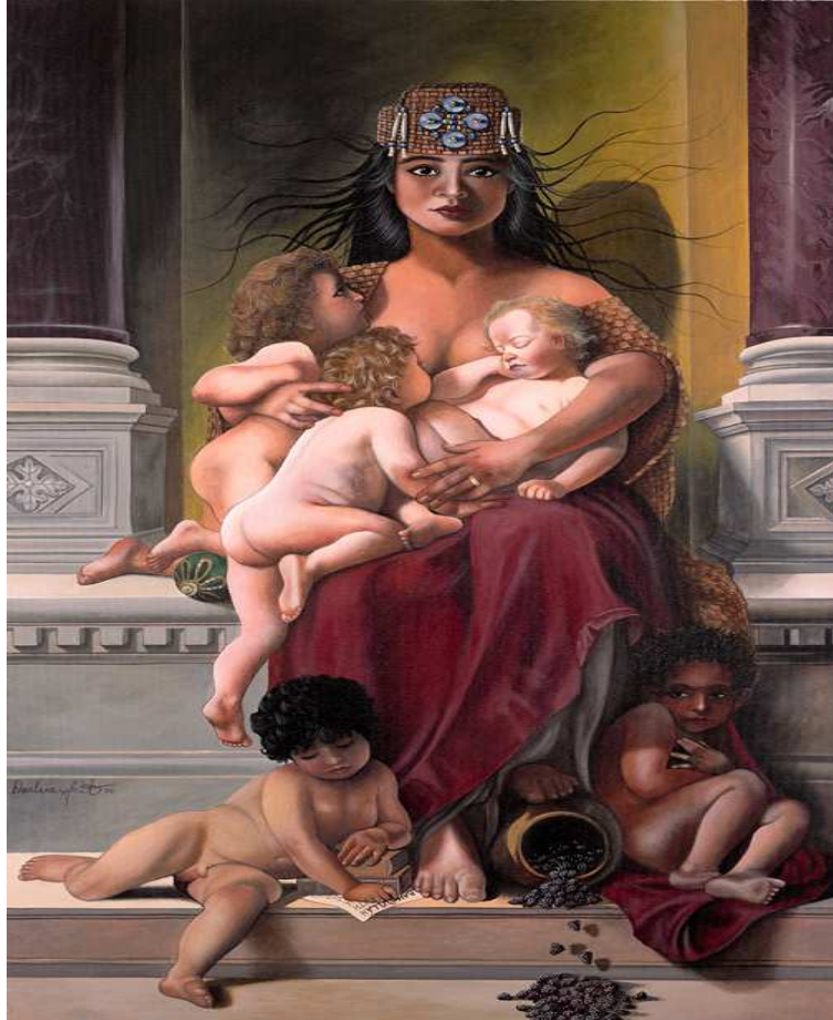
Figure 9: All my Relations

who wouldn't approach her to see the wisdom from her eyes and learn from the wisdom embedded there by the Creator. She offers more insight into the painting below.