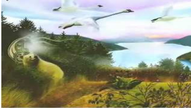
Figure 11: Spirit Bear

In the image Spirit Bear, this participant shares how through learning to meditate she has learned to be okay with who she is while at the time invoking the Spirit of Bear to come and heal the land and the people. The poem she shared embodies her hopeful sentiments.