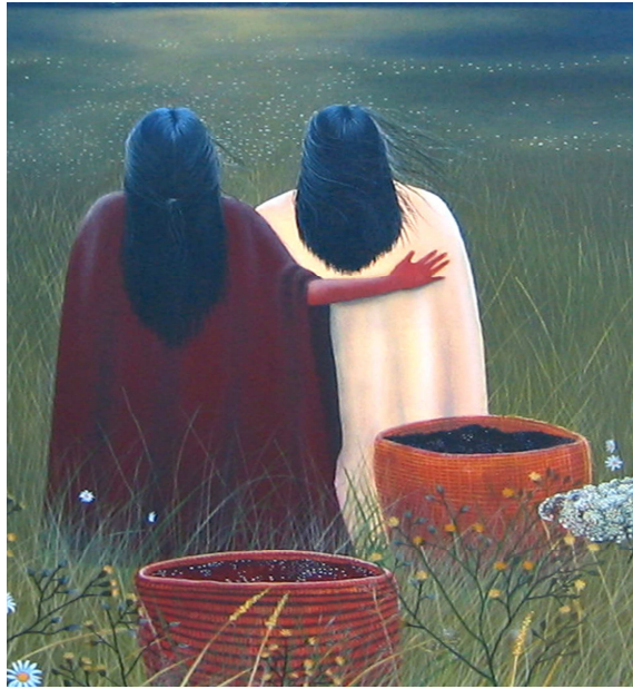
Figure 12: Appreciation

on the in Victoria surrounded by the ocean and the land where her Coast Salish people had once lived and flourished was emotional healing and morally uplifting, “I know I’m supposed to be here, I feel at home here and I see so much hope and promise for our people here” In this painting aptly name “Appreciation” she shares the comfort and healing that comes from sharing the beauty of the land with loved ones.