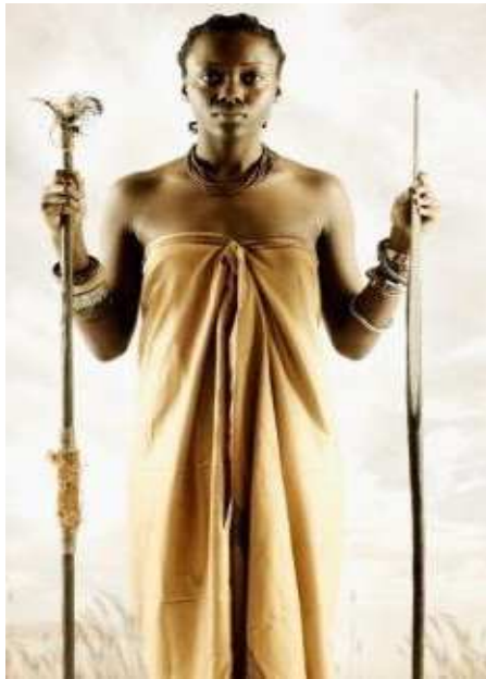
Figure 13: Traditional Kikuyu Woman

main character to watch, listen, run, dirt, hide, and spring to action when the opportunity afforded itself. I would sing these choruses as she listened to me until she saw me laugh and be happy, again. Sometimes she would ask my opinion on the actions taken by the main characters and what I would have done. Then she would end each story by reminding me how delighted she was to have a name sake like me and how she knew I would do great things. I have no idea whether my grandmother talked to this individual but he did stop his abusive behaviour and continued to treat me with great respect until he died. I also do not know whether she ever let my parents know of his mistreatment of me in their absence. I know I haven't as yet grasped the effects and importance of these times spent with my grandmother. In fact until the writing of this dissertation, I hadn't thought much of them.