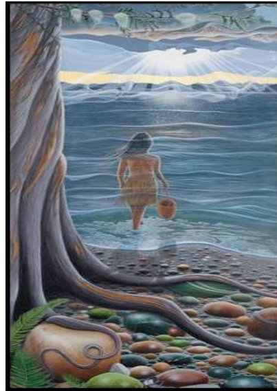
Figure 6: Spirit of my Ancestors

of the ocean to listen and receive the wisdom and lesson from her ancestors. In our discussion about this image, she share how this image honours the place of the Coast Salish woman's role of listening and carrying out her healing messages from Creator to her community... "Women have a very important role for my people... they are healers and nurturers...we haven't really seen the true power of our First Nations' women, yet"