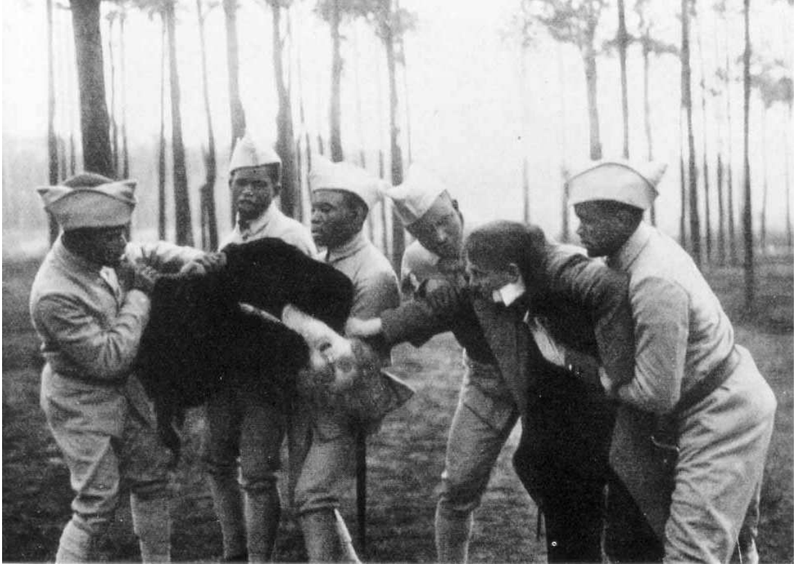
Figure 3: Scene from Propaganda Movie (Wiggin p. 560)

Wigger notes how through this campaign, Germany placed the German White woman as a figurative “medium of the imagined Black threat” (p. 558), and in the process placed the burden of maintaining an untarnished and unpolluted German on the bodies and psyches of women. Gender in this case, became central to the Black shame campaign by pitting the Black soldiers, who were described as primitive and barbaric, against the White upper class women, who were seen as the “ideal of purity and civilization” (p. 558). Class entered into this scenario as the images of the imagined rape of White women portrayed women from the lower class sector as the actual victims of this sexual brutality and the upper class women as the implied victims. As well, the campaign portrayed women from the upper class sector as “conscious, passionate