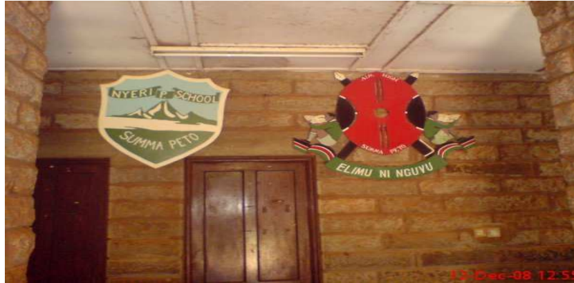
Figure 10: Nyeri Primary School

The participants' stories of schooling weren't unlike mine and those of the students I studied with back in Kenya. All their parents stressed the importance of a good education, over and above any other gifts they had: