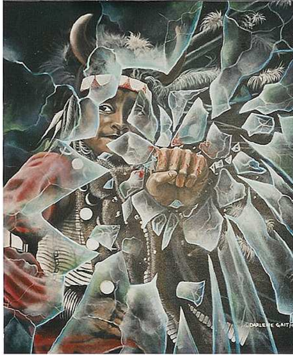
Figure 8: Freedom

It's through her dreams and sense of intuition that she is able to paint images that depict her People's wholeness, hope, and victory, despite any contrary information received through the media or the ills and difficulties her community is going through right now: