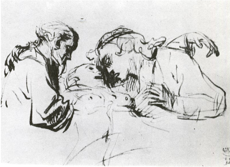
Fig. 15. Rembrandt, Lucretia , sketch.