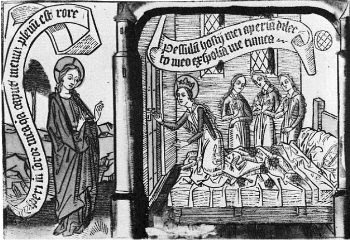
Fig. 6. Dutch School, Canticum Cantorum , (c.1460-70) Bayerische Staatsbibliothek, Munich.