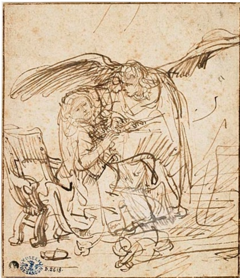
Fig. 1. Rembrandt, Annunciation , 1635, Besançon Museum of Fine Arts and Archaeology, inv. D. 2618.