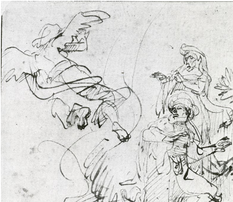
Fig. 17. Rembrandt, Manoah's Offering .