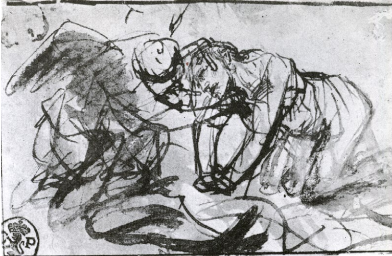
Fig. 26. Rembrandt, Agony in the Garden .