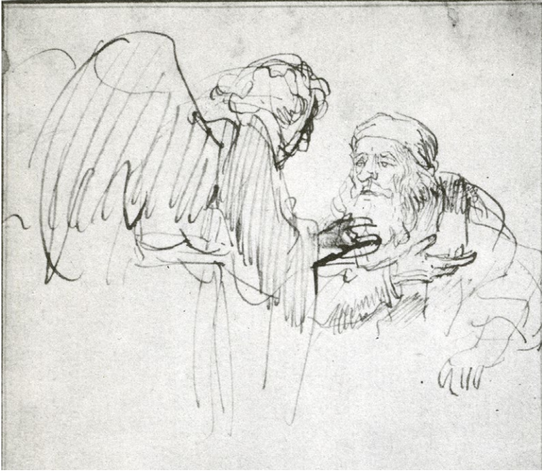
Fig. 20. Rembrandt, Abraham and the Angel .