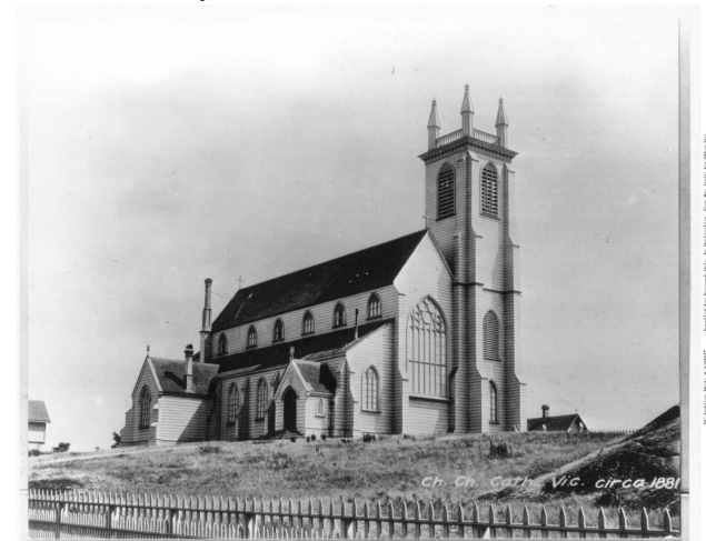
Image: Victoria's second Christ Church Cathedral (BC Archives A-01047, 1881)

Second Anglican cathedral in Victoria replacing the first building which burned in 1869. The building was designed by architect Hermann Otto Tiedemann, its cornerstone was laid by Joseph Trutch in May 1872.