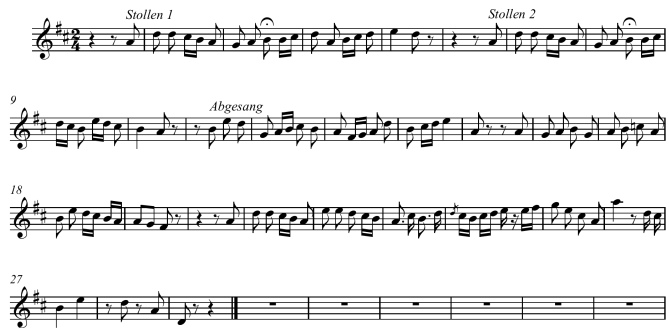
Figure 8: "Johannessprüchlein"

It is clear from this analysis that Beckmesser is closer to the traditions of historical Meistergesang than Walther. His music eschews the chromatic, developmental nature of Walther's pieces and mimics the clear phrases, melodic simplicity, and repetitive nature of Morgenweise and Silberweise . This is not to say that Beckmesser's songs are more artistically valid than Walther's. Meistergesang , though glorified by Wagner and other artists of the nineteenth-century, was recognized as a tradition in which "obedience to the rules" led to a "paucity of good Meisterlieder." 26 Wagner seems to support this negative view of Meistergesang . After all, Sachs and Walther are presented as the heroes of the opera, not Beckmesser and his more historically accurate songs. Combined with Beckmesser's satiric presentation, Wagner appears to deride Meistergesang throughout the opera by making it the symbol of a pedantic antagonist.