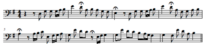
Figure 6: Stollen 1 of “Den Tag” reduction

Repetition also forms an important component of Beckmesser’s songs, if not to the same density of Sachs’ Meistergesang . Repetition found in “Den Tag” is reminiscent of that found in the Stollen and Abgesang of Silberweise . Unlike traditional Meistergesang , there is no direct repetition between the Stollen and Abgesang that serves a unifying function in Beckmesser’s songs. However, the repetitive nature of the coloratura, which is always based on the descending fourth, connects the two halves of the piece into a unified whole.