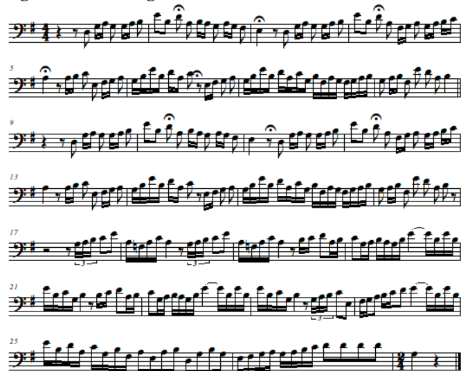
Figure 5: "Den Tag"

There are some divergences from traditional Meisterlied in Beckmesser's two songs. Both feature an