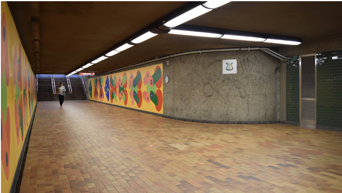
Illustration 2 - Busking spot at Assomption station.

The spatial lay-out of this spot is near-ideal: at a widening in a corridor, mid-way between stairs to the surface and escalators leading down into the station. But, adjacent to the lyre sign, a large outlet for the metro ventilation system is the source of a constant droning noise—a major acoustic nuisance. I did not see any evidence of buskers using this spot.