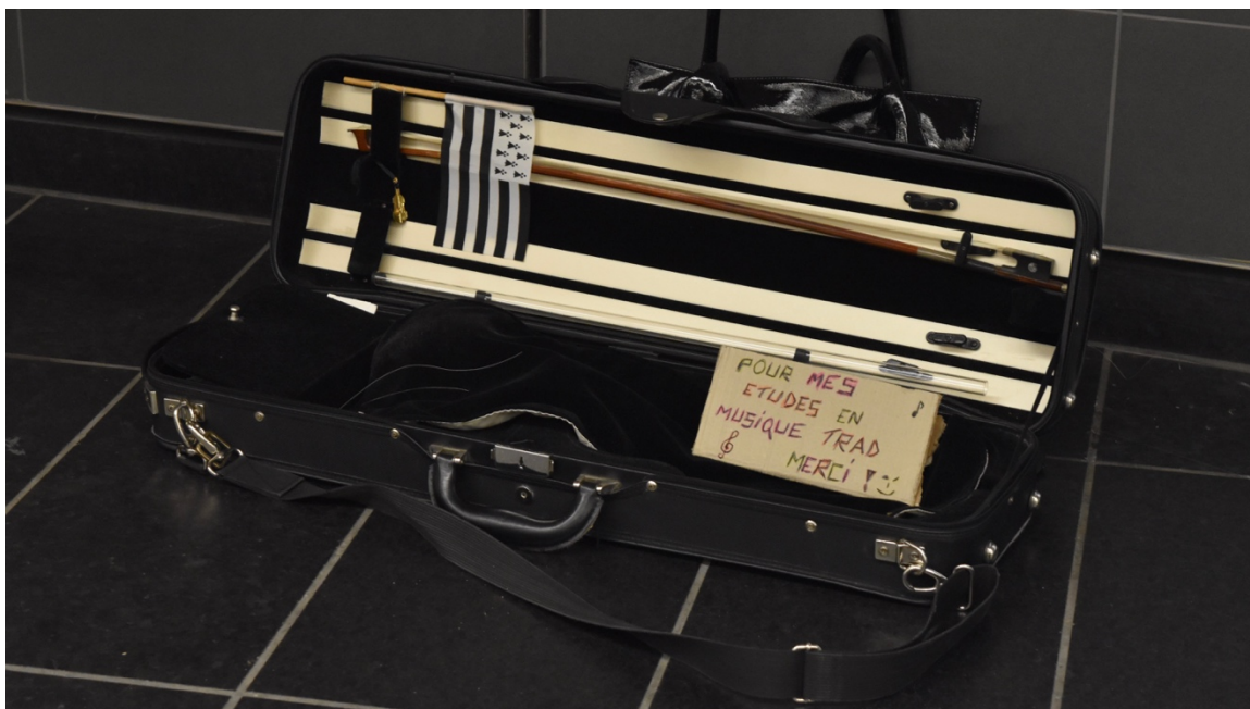
Illustration 16 - Alexandra's case.

you!”), and a small reproduction of the flag of Brittany, where she is from (Illustration 16). She says that other Bretons (there are many in Montreal, she says) will sometimes see it, and stop to talk to her. Some performers have business cards on display in or next to a case.