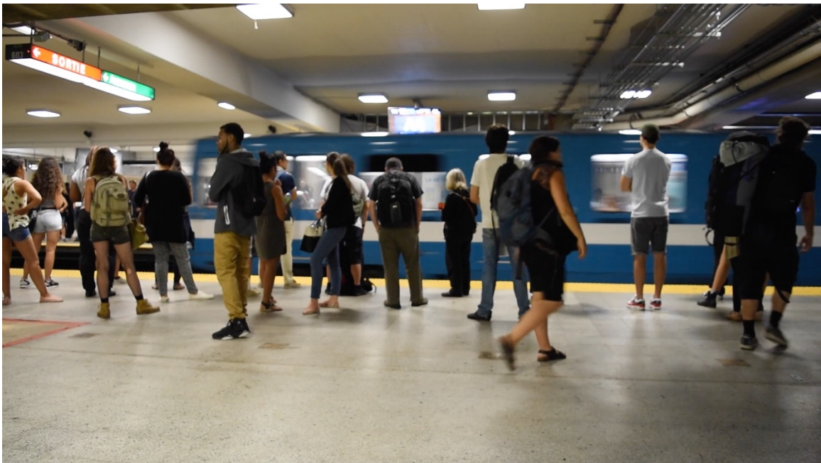
Illustration 9 - The Orange Line at Berri-UQAM station.

Nonetheless, she is confident about her ability to support herself this way for the time being. She started playing in the metro primarily for the earnings, but making new contacts as she builds her career is also a central motive. She also connects busking with mobility, saying that she has played on the street in a few other cities, and appreciates the freedom that comes with it. She occasionally gets a gig playing at a bar, café, or a private function, and is working on an album of her own material. She thinks of herself first and foremost as a musician—but one who busks. Roughly half of the songs that she plays are her own compositions. For her, being a busker is not so much an ‘identity’ as something that she does, in her capacities as a musician. Whereas, being a musician is a central part of who she considers herself to be. I don’t want to interrupt her for long, and she starts up another song. As I turn to go, I hear a great raucous rumbling signaling the arrival of the next human wave swelling up into the corridor and beyond.