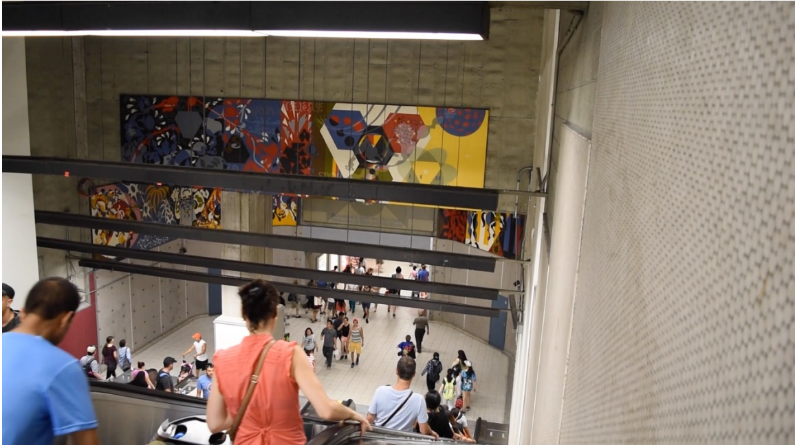
Illustration 8 – Commuters descending to the Yellow Line at Berri-UQAM station.

When I reach the bottom of the escalator, I see a young woman in the corridor ahead, with acoustic guitar, small amplifier and head-set microphone. A few seconds later, she starts up a song. The crowd coming down from above is thickening, and I slow to listen and watch from a short distance for a few minutes. Part way through the song, the Yellow Line train arrives and, in a moment, the corridor is flooded with moving bodies, some seeming to take notice of the busker, most simply hurrying by, concerned with their varied destinations. A few coins are tossed in her case and she nods in acknowledgement. When she reaches the end of the song the corridor is virtually deserted again. She introduces herself as Conley (a stage name that she has adopted for her music career), and says that this is her most regular spot. She started busking a year and a half ago. As of April, she has been busking full-time, attempting to live solely from her music. She said she made the transition from doing it periodically on the weekends to relying solely on busking, after another, more experienced busker convinced her she would easily make more money than she earned at her minimum-wage job. “It’s been going well,” she says. “I make the same, and more, now.” But, she goes on to say “I’m actually afraid of what it’s going to be like for me in the winter... there’s a lot more competition [for spots].”