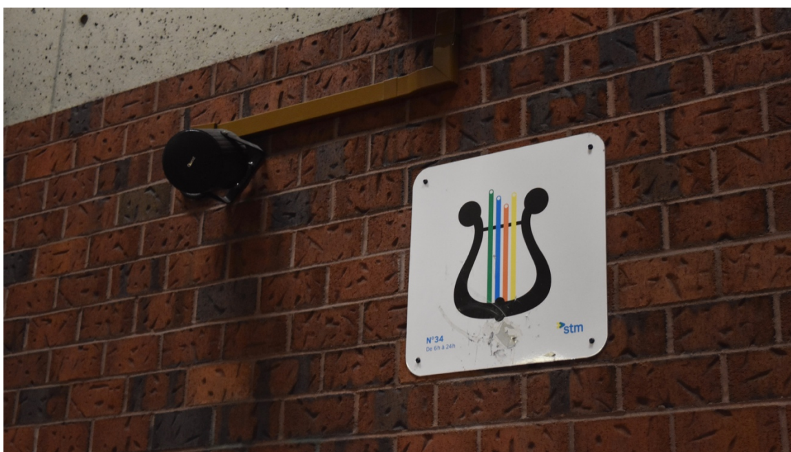
Illustration 1 - Lyre sign at Namur station.

with auditions usually taking place in September. Only some are Étoiles spots; most operate on the list system, allowing anyone to play there—Étoiles musicians and freelancers alike. Chapter 2 provides some historical context on this, while Chapter 3 details the differences between these two regulatory systems for metro buskers. Freelance busking spots are indicated by a sign with a stylized lyre (a small harp-like stringed musical instrument), referred to in the following pages as a lyre sign . Buskers will occasionally simply use the shorthand “lyre” when speaking of these signs. Spots that are reserved for Étoiles musicians have a different, larger, sign to indicate this.