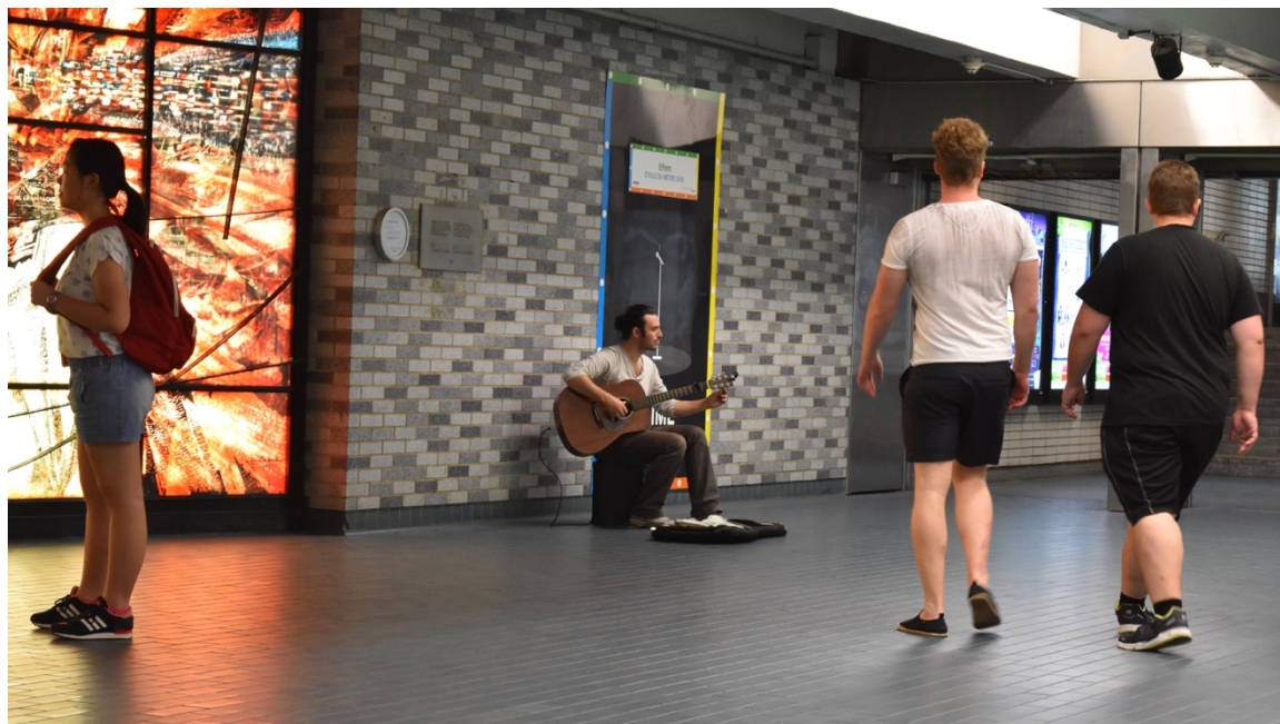
Illustration 14 - Effem at Place-des-Arts station.

vulnerability busker may face, not simply in how much they may earn, but if they will be able to perform at all.