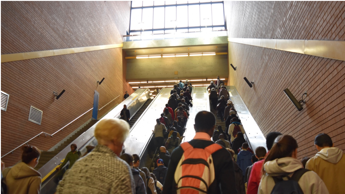
Illustration 18 - Ascending to the surface: commuters at Montmorency station.

may simultaneously produce novel forms of encounter and Gift-performance, new routes of social and material circulation, ever expanding trajectories of becoming.