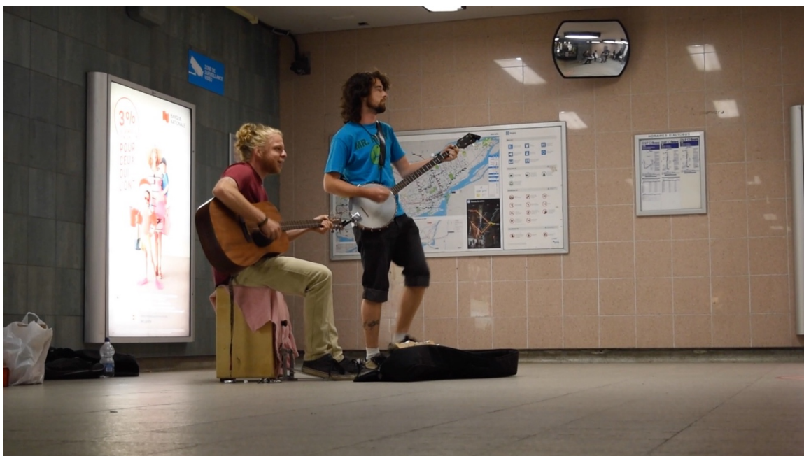
Illustration 13 - Bucket of Change at Berri-UQAM station.

standard in terms of technical and performance skills, so that not just anyone can play at those spots, a couple of Étoiles musicians said that if no one is playing at an Étoiles spot and a freelancer wants to play there, then they have no objections, though it is against the MusiMétro and STM rules.