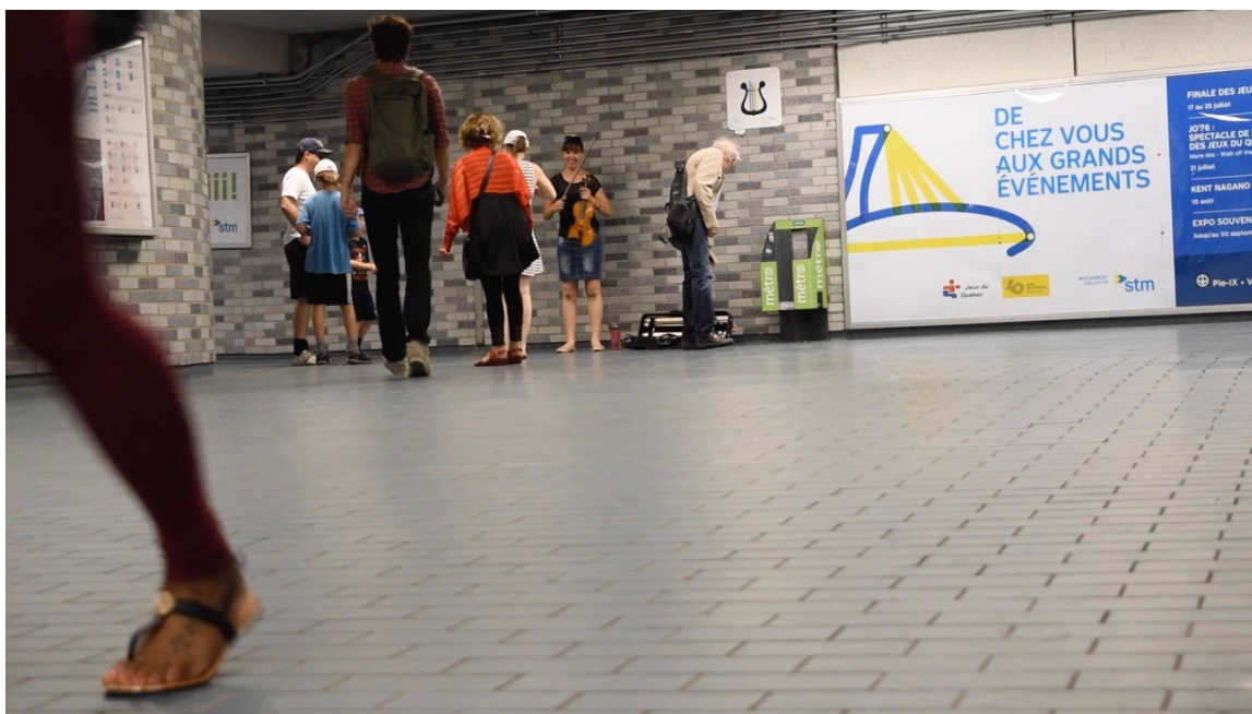
Illustration 7 - Alexandra at Place-des-Arts station.

sound of a violin echoing through the station. At a distance, the normally distinct contours of the instrument's sound take on a muddled warmth, blending with and blurring into the open space above the metro line. Coming closer, I turn a final corner and see a young woman playing what might be described as 'traditional-style folk music'. She stands with her back to the wall, facing the metro turnstiles, about 25 meters away. Her violin case is propped open, the lid leaning against the wall, and she actively watches passersby, smiling at those who acknowledge her, and bowing slightly when someone drops some coins into her case. I watch from a distance. She plays with precision and concentration, but seemingly always remaining aware of the comings and goings around her. She pauses for a break and chats with some passersby who have stopped in front of her (Illustration 7).