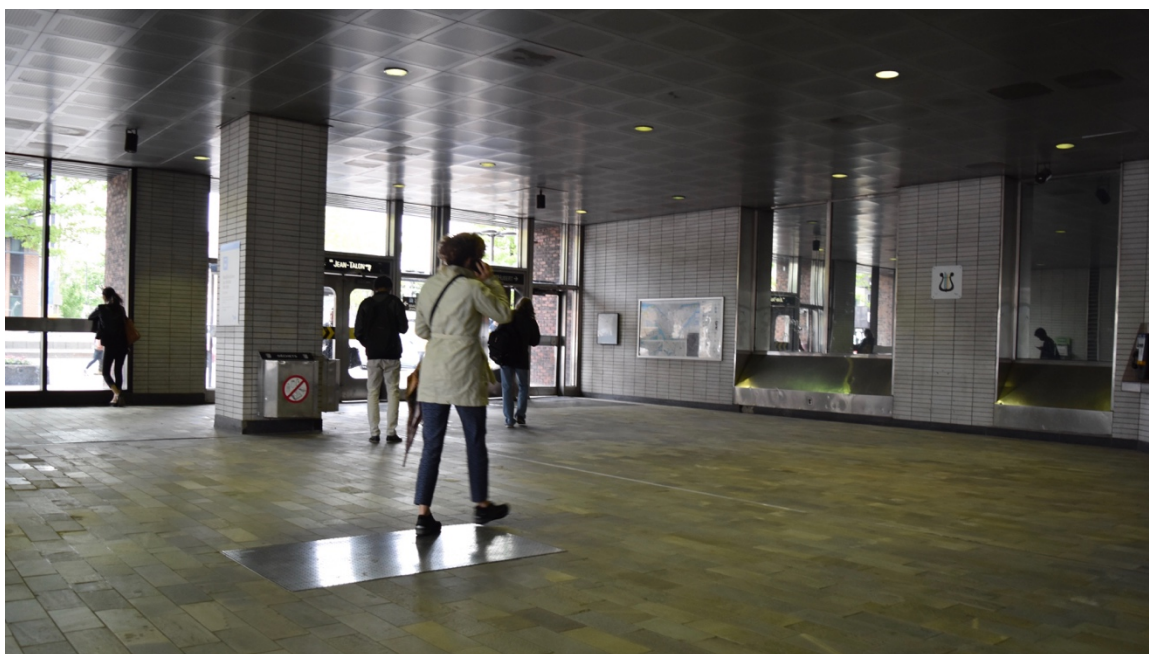
Illustration 3 - Street-level spot at Jean-Talon station.

have seen a steady rise in income in recent decades: Villeray, Little Italy and Petite Patrie. There are four entrances into the station, spaced out over a couple of blocks on Jean Talon street, a main thoroughfare that stretches across the central part of the city. Of three designated busking spots at Jean Talon station, one is at street level and is rarely used. During my entire fieldwork period, even though I passed it dozens of times, I never saw anyone performing there. One participant later told me that he had played there a few times, but his was the only use of that spot reported to me. As with other street level spots, it is subject to strong winds when someone comes through the doors, and would be completely unplayable in the winter. In addition, though there is fair degree of foot traffic passing by, it is extremely variable throughout the day, becoming very slow at times.