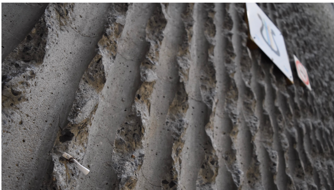
Illustration 10 - Tactical responses to material constraints: the spot at Joliet station.

ways performers position themselves in relation to the surrounding space and passersby, in the placement and particulars of the instrument case, hat, or other receptacle used for donations. The specifics of the practices that metro buskers engage in are as varied as their motivations, further supporting a concept of busker as ‘assemblage-process’ (as opposed to a bounded, discrete profession, identity, or subject). It bears repeating here that what a metro busker “is” can only be effectively conceptualized as existing at the intersection of numerous social, material and personal (i.e. specific to individual buskers) factors. Further, the act of being busker is enacted in lived practice—consequently, never completely fixed but always in-the-making, socially produced (thus bearing inherent constraints) and individually performed (therefore singular in its myriad concrete manifestations).