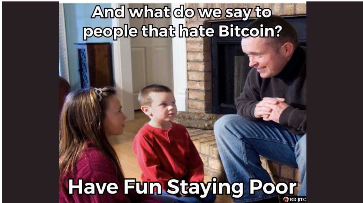
Figure 2.1. Have fun staying poor meme (cf. 'BitcoinBull' 2021).

blockchains can cause capital arcs in other, unanticipated ways to establish conditions for economic difference to actualize. These blockchain initiatives illustrate the media's capacity to establish diverse flows of generative power, where joyful subjects form