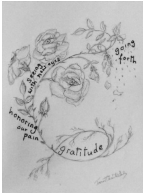
Figure 3. Four-part "spiral." Drawing based on Macy and Johnstone's (2012) plant (p. 39).

My groups found this exercise fun to do. It connected the trees of the Elm Dance to their own tree of life, and to their ancestors, descendants, legacies, and life-work—all potentially at risk if we don't act to correct climate change. This led to the first part of Macy's and Johnstone's (2012) 4-part "spiral" (p. 39) which guides the workshop. My drawing of a rose (Figure 3), represents this spiral, which starts with "gratitude" (p. 39) for what we have now. This invigorates participants for the difficult work of facing the truth about the state of the planet, "honoring our pain for the world" (p. 38-39). The third part of the spiral is "seeing with new eyes" (p. 39 -41), which leads us to action, "going (or growing) forth" (p. 37-41)—the seeds of transformation of our civilization and its home. Gratitude again follows action, and so on—hence a spiral.