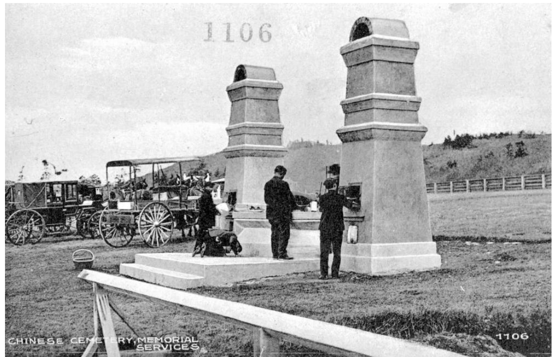
Figure 9 The altar at the Chinese cemetery, Victoria 49

The photo above was taken in 1892 at Ross Bay Cemetery. Most Chinese in this photo maintained their traditional style with the pigtail and Chinese clothing. However, when the Chinese were seen in the Chinese Cemetery in 1903 as shown below, their clothing style was very different from before. Even though the Chinese apparently dressed in a more “Western way” during the ritual process in the picture, they preserved the traditional methods of showing respect to the dead by kowtowing in the graveyard and burning offerings to be sent to spirits. Sacrifice, burning paper money, and offering incense were still the most important parts of the ceremony.