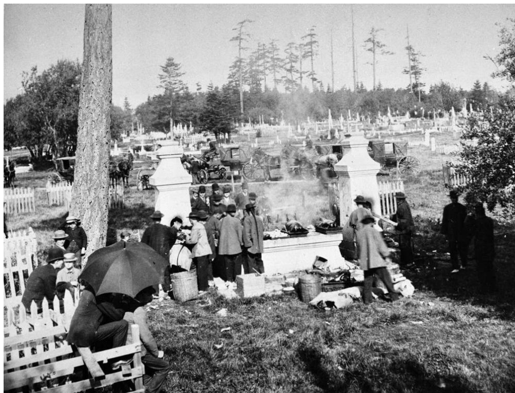
Figure 1 Funeral at Ross Bay Cemetery, Victoria| BC Archives , D-05257, 1900

Large Chinese funerals were usually held for famous Chinese people; these ceremonies started with a funeral procession in Chinatown and wound through the streets until they reached the cemetery. For example, in 1879, a funeral for the Chinese merchant Yip Jack, who was also a member of the Chinese Freemasons, was witnessed in Cormorant street: