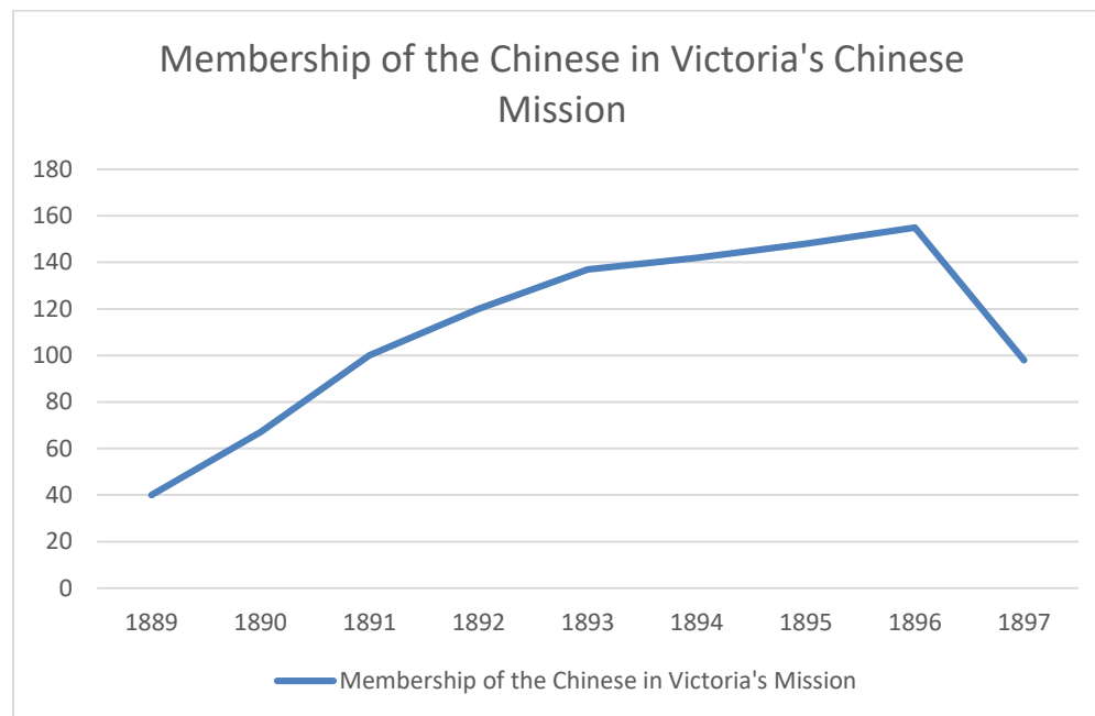
Chart 1 Chinese Membership in Victoria's Chinese Mission Methodist Church, 1889-1897

Source: Minutes of the proceedings of the third (to eleventh) session of the British Columbia Annual Conference of the Methodist Church