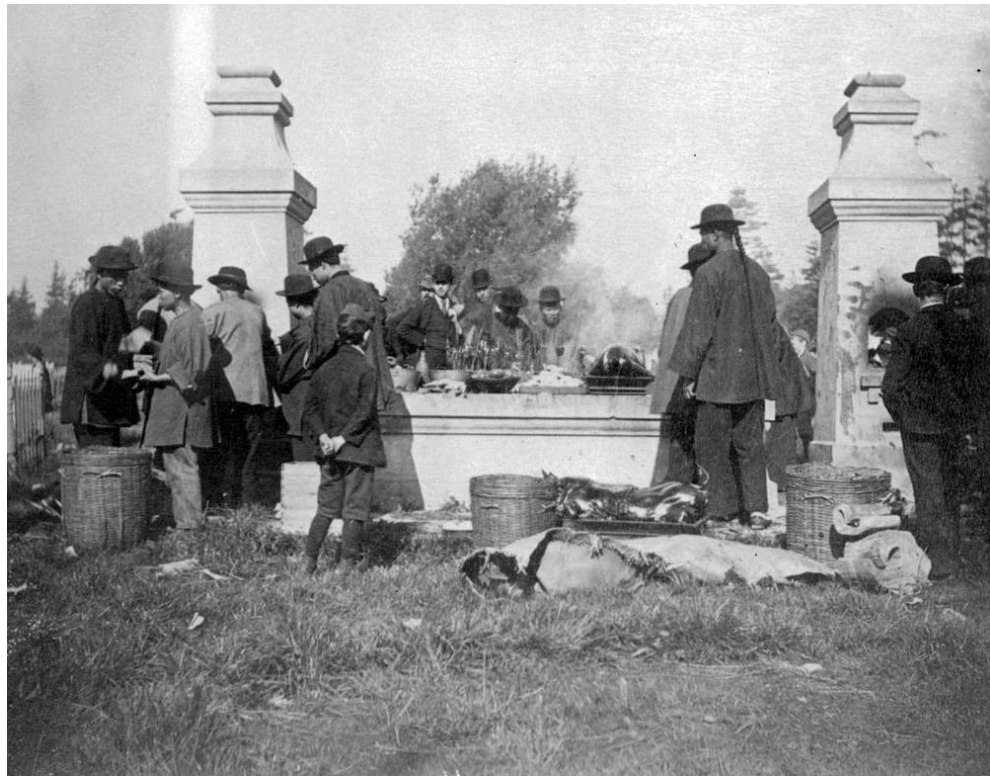
Figure 8 Chinese funeral, Victoria