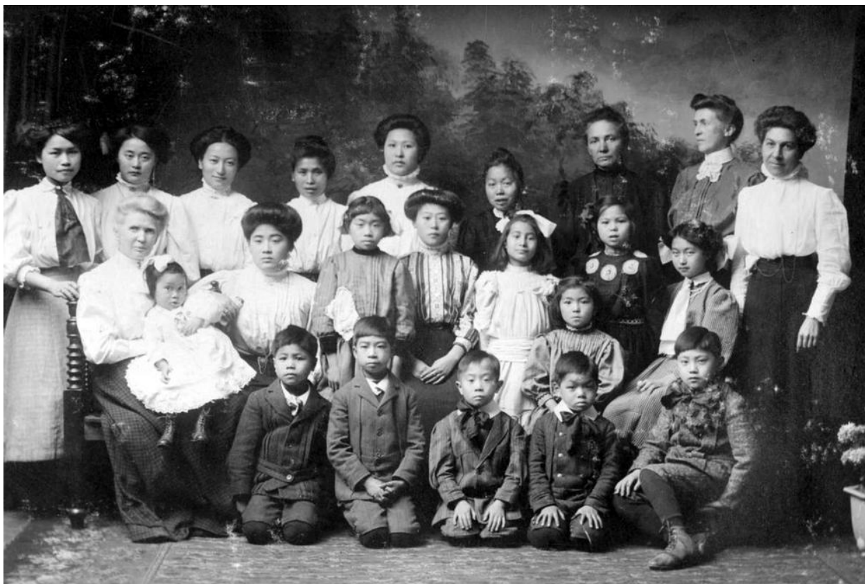
Figure 3 Victoria Oriental Home and School Group [some were Japanese women]