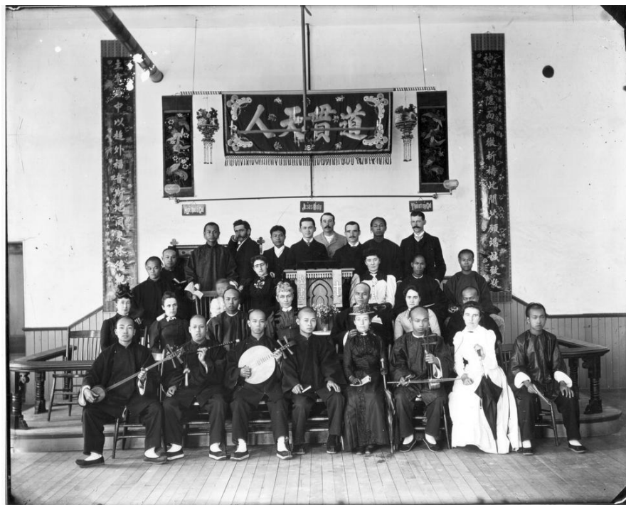
Figure 10 Group in Chinese Christian Church, Victoria

Further, Chinese churches contained elements of Chinese decorations, such as Chinese calligraphy written in couplets, which were normally seen in Chinese shrines. Once a missionary described what he saw, “[M]ottoes on the wall were written both in English and Chinese and a Chinese map is hanged in the room.” 54 The photo shown above is part of an archival collection that provided a more direct impression for us to observe the particular decorations found in a Chinese church. A scroll is hung in the middle of the wall, with the embroidered words in Chinese as “Dao Guan Tian Ren,” which is usually related to Daoism, meaning that both human and nature (or heaven) are under Dao (the Way), with couplets appeared on both sides of the scroll, along with two Chinese symbol embroideries and two Chinese floral lanterns.