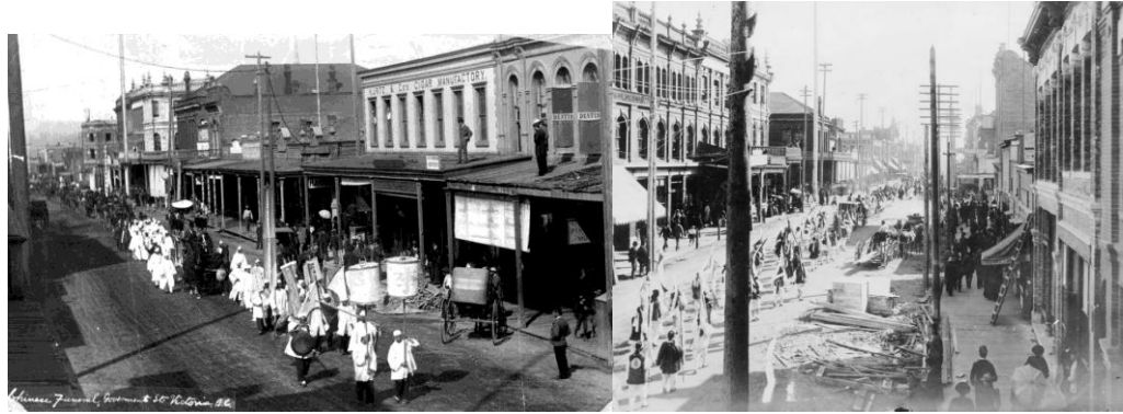
Figure 6 Chinese funeral, Government Street, Victoria BC (Left); Figure 7 Chinese funeral procession southbound on Government Street, picture taken from Johnson Street (Right)