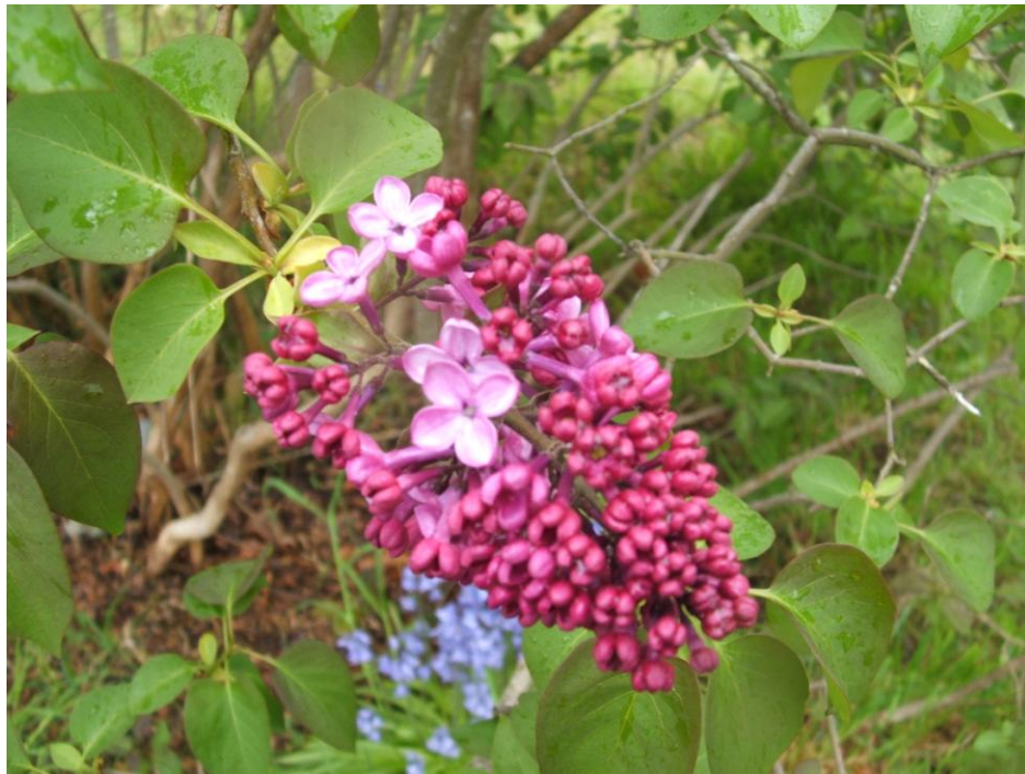
Figure 8: Grizzly's picture and caption

Yeah ... I'd be like, I kind of just want to get there, let's go. But now since doing this project you have to take a picture of something right, then we all stop, and click a picture. It's a different world through the glass... (Snow Leopard)