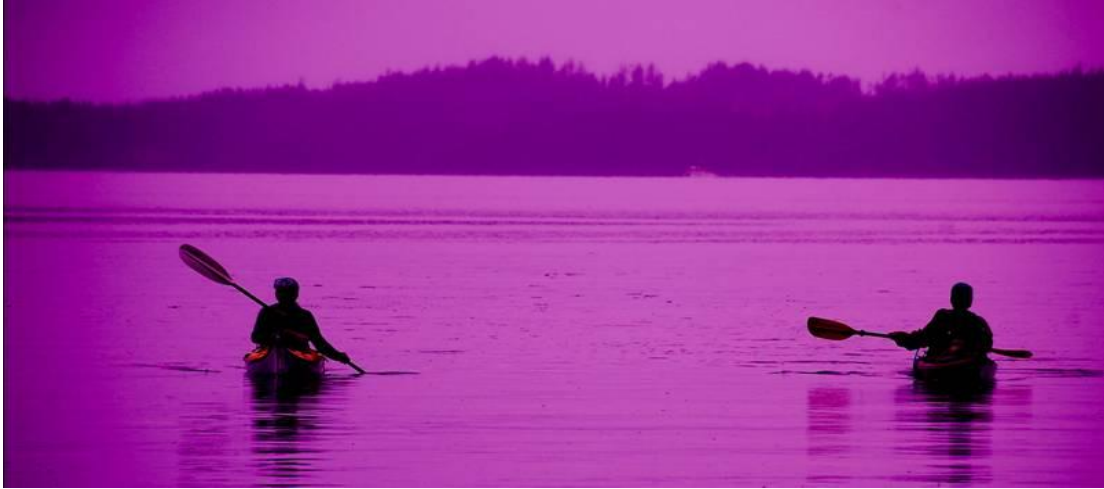
Figure 5: Mr. Smith's picture and caption

This theme was also reflected in the first few sentences of Mr. Smith's picture and caption below: