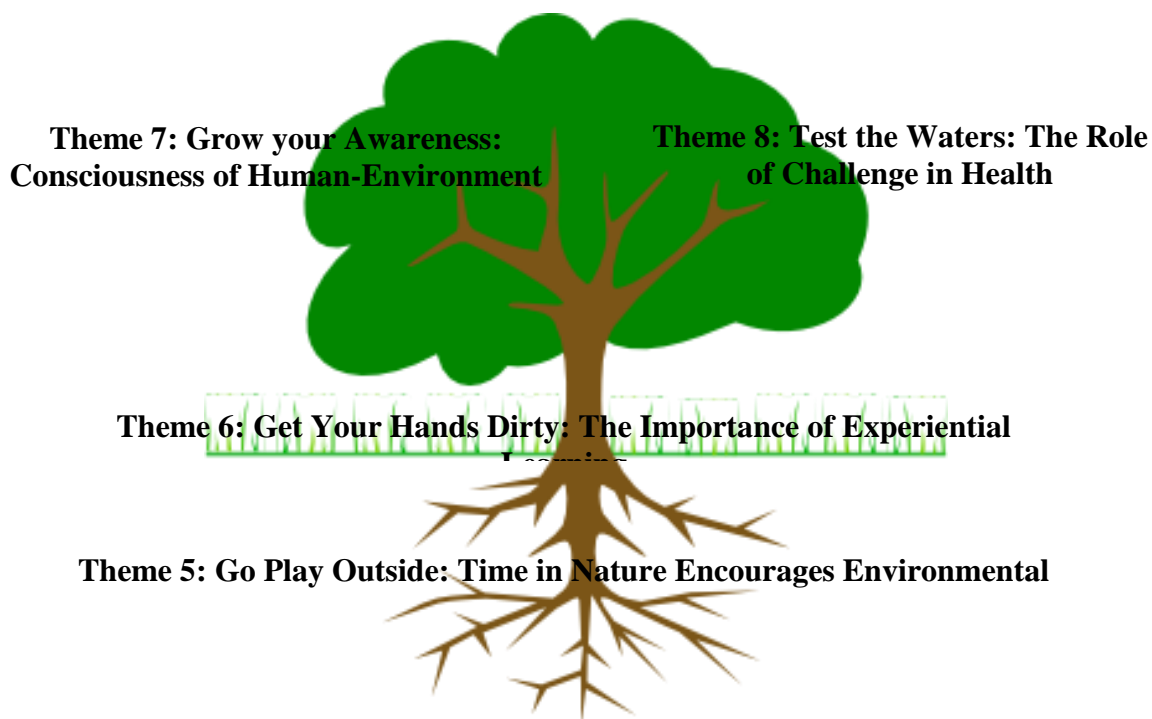
Figure 1: Tree of Strategies for Engagement in Nature through Physical Activity

participants did not specify that they believed these steps were sequential, but it was implied in their comments.