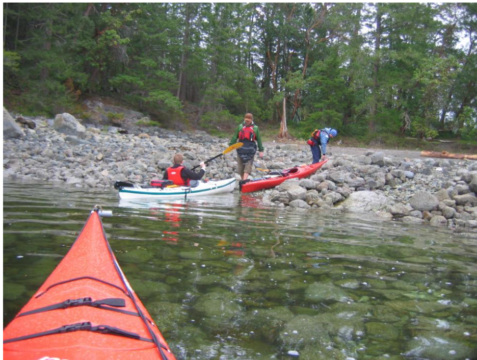
Figure 4: Cougar's picture and caption

least their most recent experiences, took place in the outdoor sustainability education program in which they were enrolled. Regardless, the learning that resulted from being actively engaged in the environment was paramount in terms of the benefits and values as seen by these youth. Not only was the learning aspect important, but further, so was the appreciation for nature that developed as a result of hands on experience. The importance of experiential learning in both education and nature appreciation is apparent in Cougar's picture and caption.