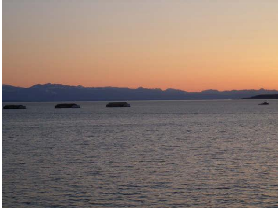
Figure 6: Shark's picture and caption

This picture changed my perspective on looking at boats because I realized how much those actually affect the shoreline. Always when we would go and make fires down below, I'd see all these chips...and I realized that the chips are actually off those [boats]. Like, even on our kayaking trip, there was like a foot of it which is a lot of chips that shouldn't be there. It actually shows you how far humans' garbage can actually go. You can actually see the outline of the sawdust on the top [of the boats]. They're trying to just get a few extra buckets in, and then all that, or most of that, falls off on the way up here, so they're losing like 5% of their load anyway.