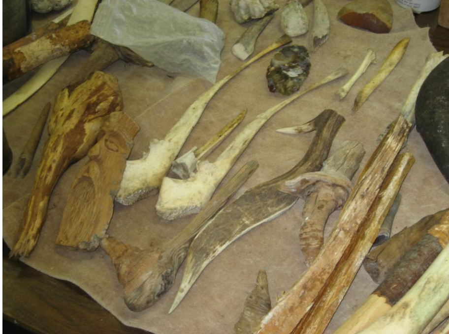
Figure 7: Maple's picture and caption

I chose this one for showing what kind of stuff people can make out of reusing environmental waste like broken branches or animal bones. You can make knives out of them or make them into tools or axe heads... Instead of making more man-made stuff, we should reuse the environment that's already dead or dying or stuff that's just waste. It's like recycling. It would be a good environmental move and it would be good for people's health just to get out there in the environment and explore.