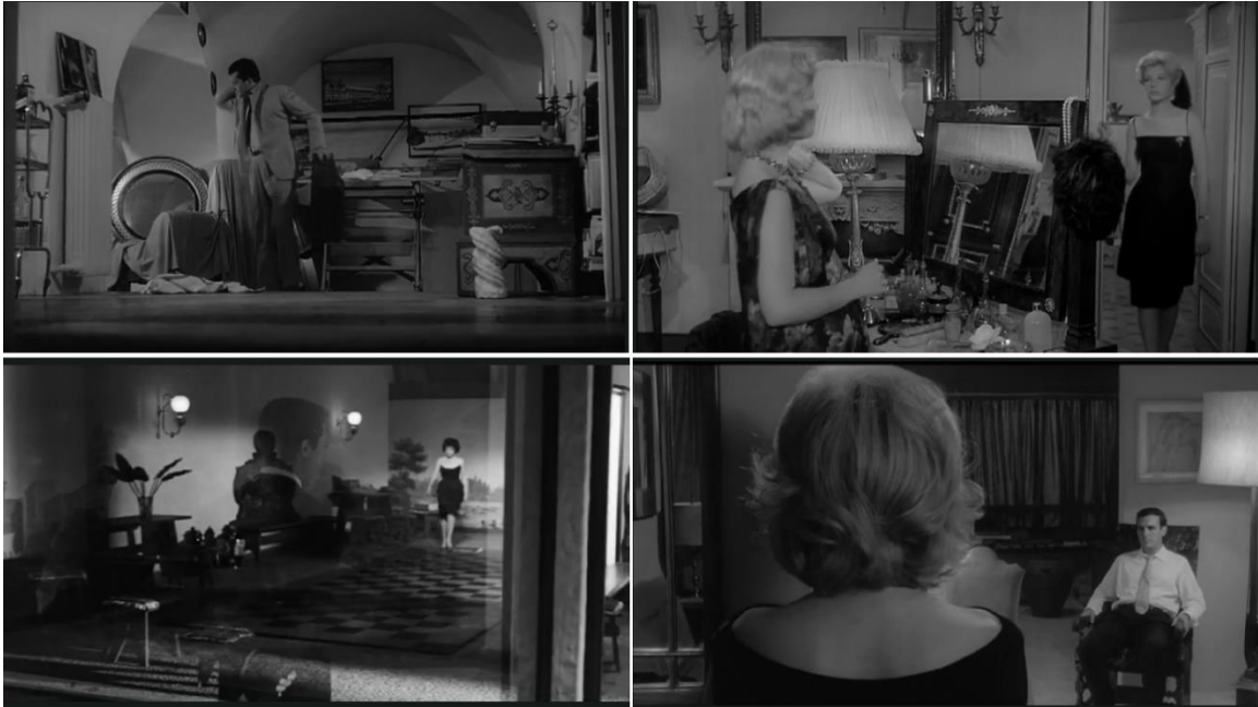
Figure 3.2: Michelangelo Antonioni, L'Avventura (1960), La Notte (1961), L'Eclisse (1962): Drawing attention to offscreen space by placing a mirror in the middle of the scene so that you glimpse a stray piece of world there.