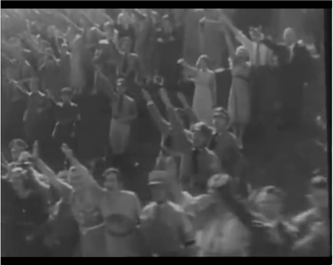
Figure 1.2: Leni Riefenstahl, Triumph des Willens (1935): The uniform, faceless masses directing the gaze towards the leader.