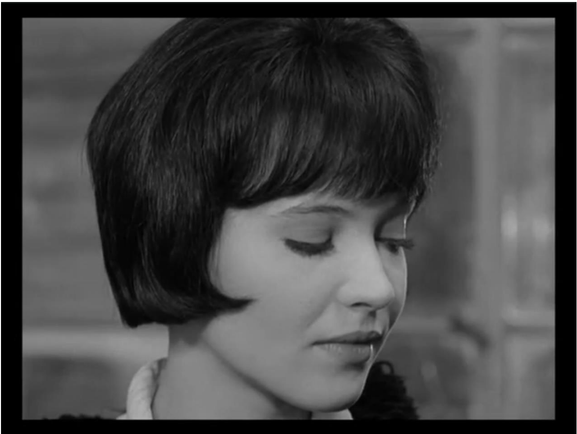
Figure 3.4: Jean-Luc Godard, Vivre sa vie (1962): Anna Karina in Godard's film a year prior to Le Mépris .