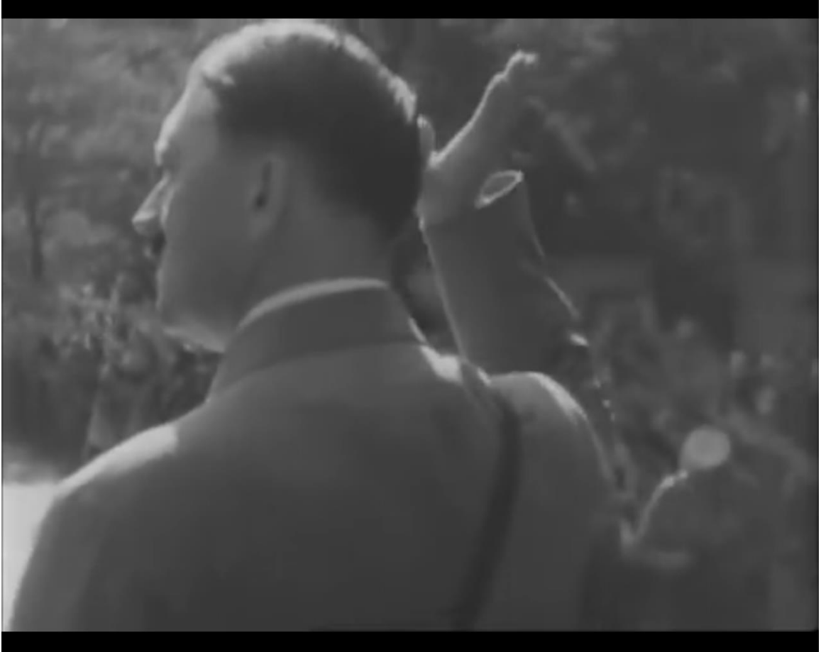
Figure 1.4: Leni Riefenstahl, Triumph des Willens (1935): The all-powerful, hypnotic leader-figure, grouped around by the masses of people/things, as the focal point of gaze, looking at neither the viewer nor the onlookers.