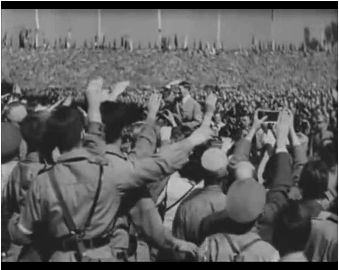
Figure 1.1: Leni Riefenstahl, Triumph des Willens (1935): The leader, central focus of the masses' gaze, looks at no one in particular.