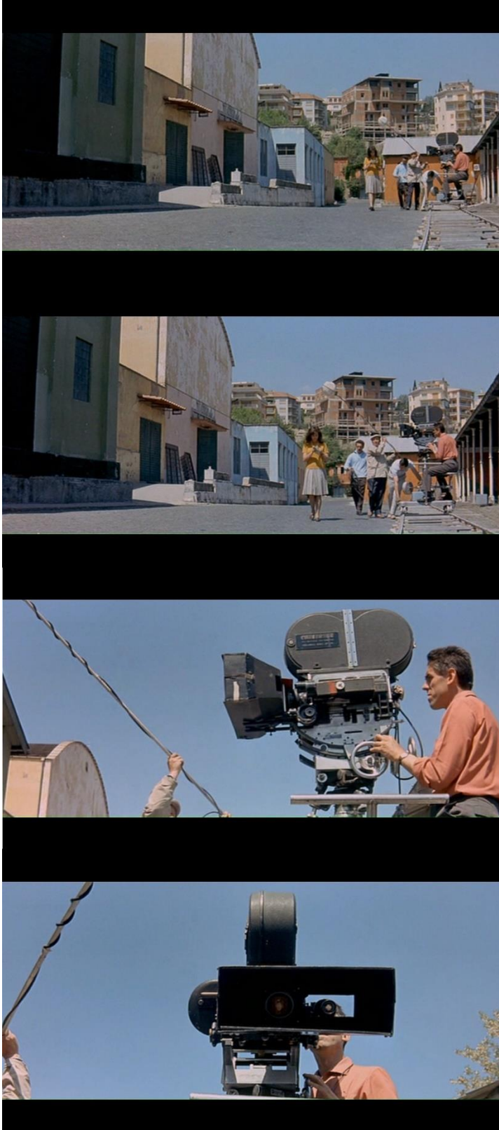
Figure 3.1: Jean-Luc Godard, Le Mépris (1963): Cinema substitutes our gaze with a world that conforms to our desires. Le Mépris is a story of this world.