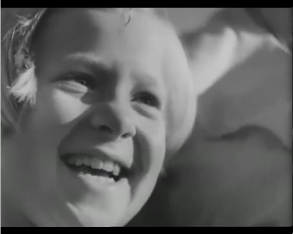
Figure 1.3: Leni Riefenstahl, Triumph des Willens (1935): The impassioned gaze of a specific onlooker, indicating to the viewer the appropriate emotion and direction of gaze.